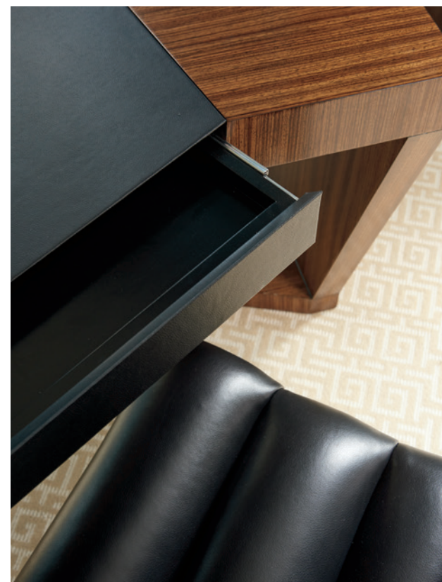
195-411 Paragon Angled Writing Table 74W x 31.75D x 30H in.

The Paragon writing desk is a signature silhouette in the collection. The angled returns on each end serve to create a defined and intimate workspace that offers better access to the entire work surface. There is one full-extension self-closing drawer in the center and the top features an onyx black faux leather writing surface.