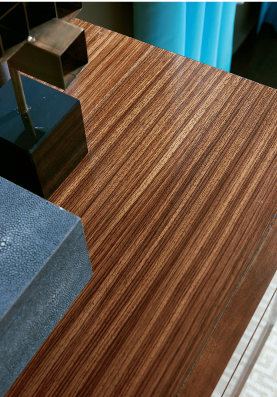
195-441 Odyssey Deck 46W x 14D x 56H in.