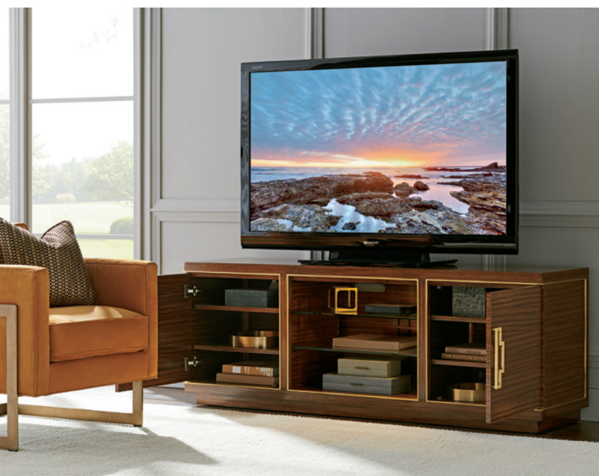
195-660 Aria Media Console 72W x 20D x 26.75H in.

The 72-inch Aria media console showcases the dramatic horizontal grain lines of Zebrano veneer across the doors and on the top surface of the piece. The center section features two adjustable tempered glass shelves and touch lighting. Behind the doors on each end are two adjustable wooden shelves. Statement hardware and hand-applied gold striping complete the look, which exudes the essence of classic contemporary style.