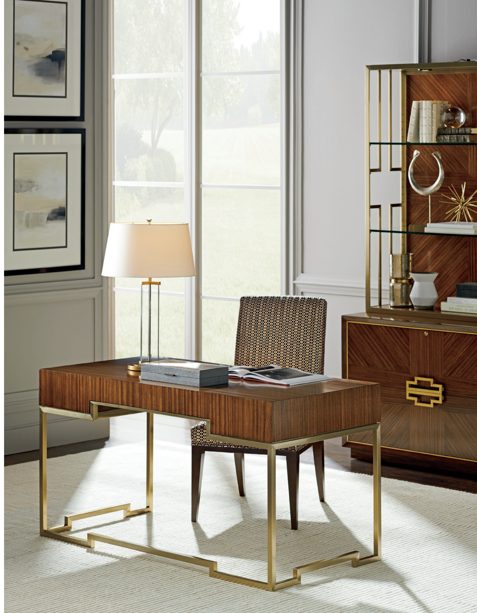
195-450 Odyssey File Chest 46.75W x 22.25D x 32H in.

The Athena writing desk offers a sophisticated architectural design that is ideal for use in bedrooms or smaller office spaces. The frame is crafted from stainless steel, finished in a rich brushed brass finish. There are three full-extension self-closing drawers for storage. Custom hardware in brushed brass features exotic tiger's eye stone inserts.