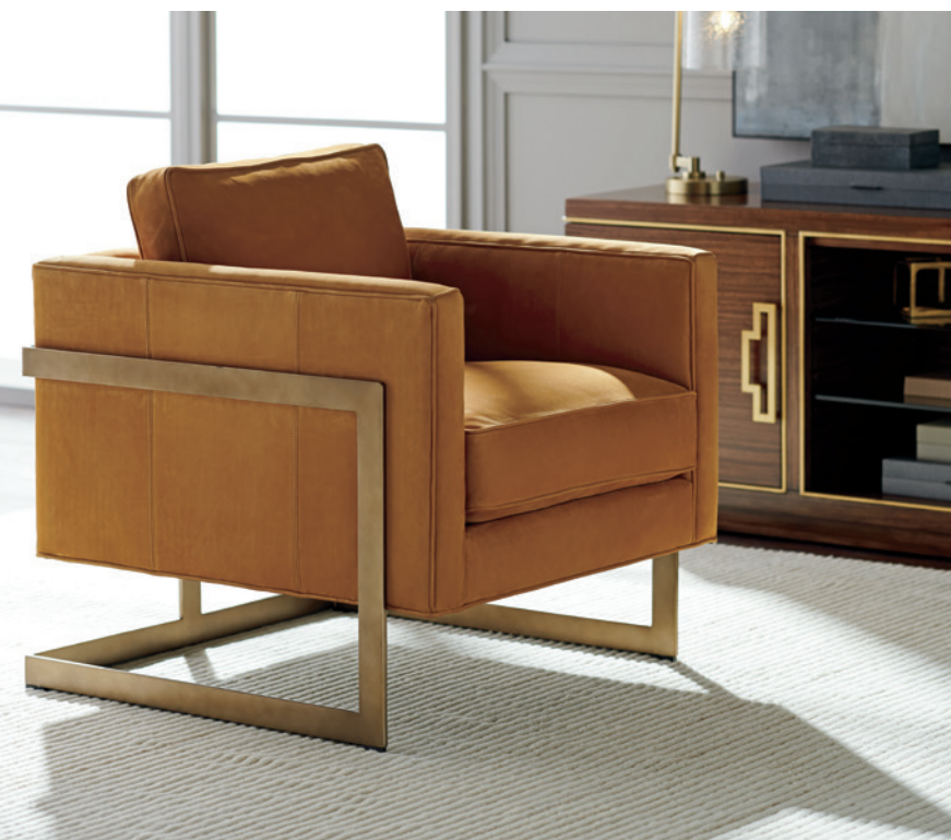
LL1924-11AA Winthrop Leather Chair 32W x 34D x 34H in.