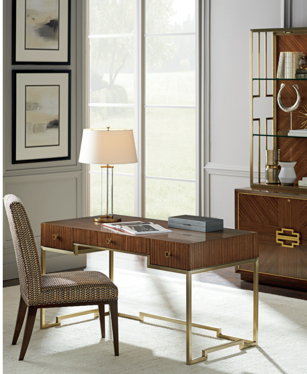
1847-12AA Lowell Side Chair 21W x 28D x 40H in.