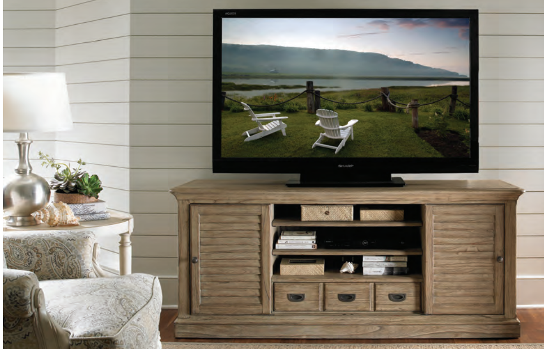
300BA-660 TRAVIS TV CONSOLE 64W x 22D x 30.25H in.