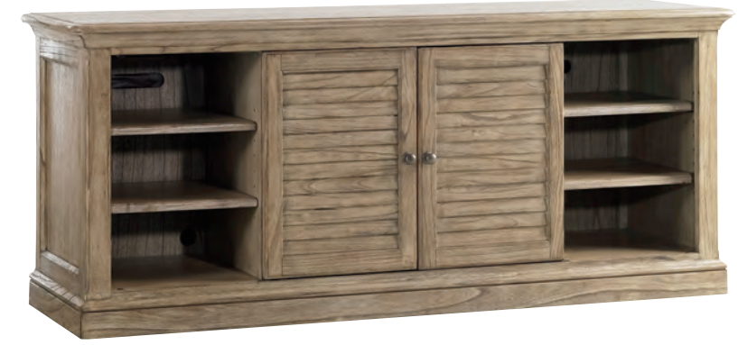
300BA-661 BULLOCK TV CONSOLE 72W x 22D x 30.25H in.

The innovative plantation shutter doors on the Travis and Bullock consoles are two-sided and pivot 180 degrees to conceal either the center or outside compartments. The center compartment features a single media storage drawer and two adjustable shelves.