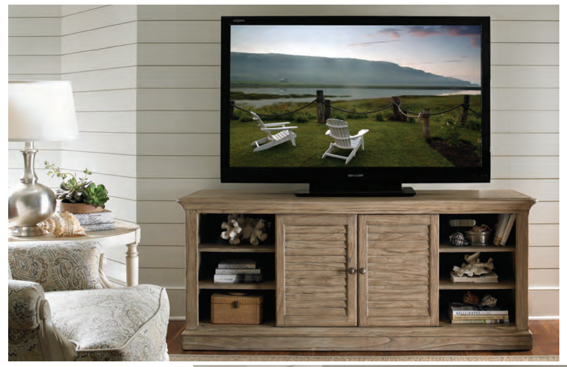
300BA-660 TRAVIS TV CONSOLE 64W x 22D x 30.25H in.