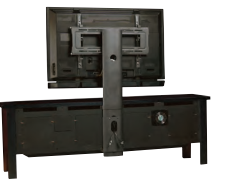
The StrongArm support system allows the monitor to "float" above entertainment consoles rather than sitting on a bulky base unit. The unit accommodates monitors up to 70" in width, and articulates vertically and horizontally to accommodate viewing. It also conceals all cords and cables from view. Available as an option.

BARTON CREEK 12 HOME ENTERTAINMENT BARTON CREEK 13 DETAILS