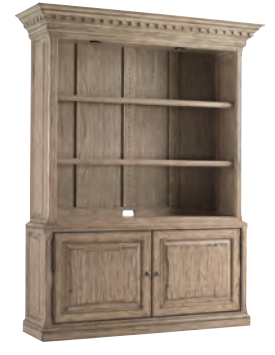
300BA-460 Mt. Bonnell Bookcase Overall: 72W x 20.5D x 91.5H in. Upper section: 2 wood framed glass shelves; touch lighting; cord management Lower section: 2 doors; 2 adjustable shelves; cord management Shown on pages: 4, 5