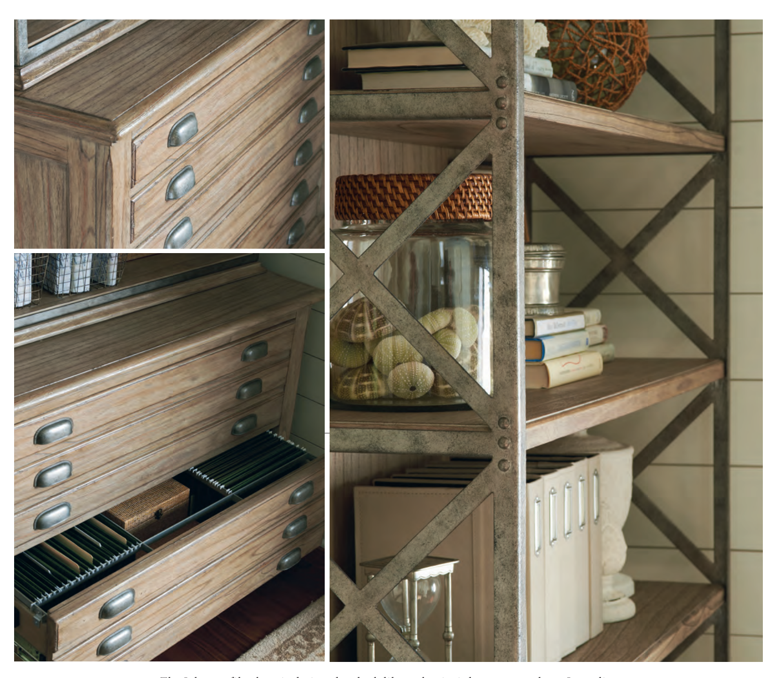
The Johnson file chest is designed to look like a classic 6-drawer map chest. In reality, it features two large file drawers. The optional deck features a vintage industrial style metal frame in an x-pattern with rivets and three fixed shelves for storage.

300BA-450 JOHNSON FILE CHEST 46W x 21.5D x 31H in.