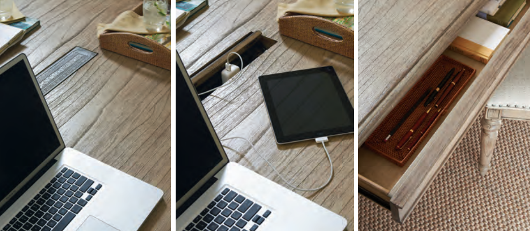
The Westlake Dining Table is designed to accommodate serious multi-tasking. A decorative antique pewter pivot door in the table surface conceals a power module with four electrical outlets and a powered USB port. The module is equipped with a circuit breaker and surge protection. There are pullout storage drawers on all four sides of the table, open storage with adjustable shelves on both ends of the pedestal base, and a hidden compartment behind a touch latch door on both sides of the base.

300BA-300 WESTLAKE DINING TABLE 78W x 46D x 30H in.