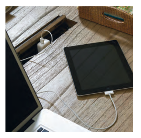
The Westlake dining table features a decorative antique pewter pivot door in the table surface, concealing a power module with four electrical outlets and a powered USB port. The module is equipped with a circuit breaker and surge protection.