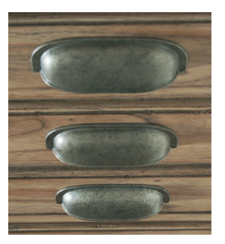
Custom drawer pulls in an antique pewter finish offer the perfect compliment to the gray driftwood finish.