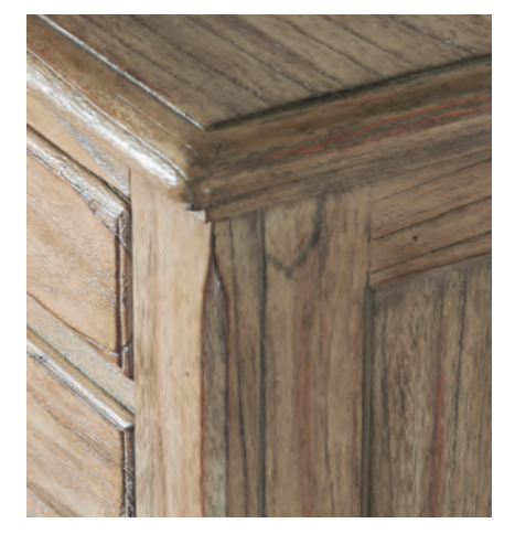
The weathered gray driftwood finish offers a modern interpretation of casual elegant style.