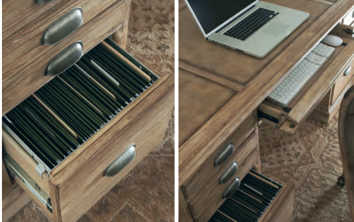
The outside back of the Austin desk features a plantation shutter design flanking two adjustable shelves. The working side includes a drop-front center drawer with ergonomic palm rest, four storage drawers, and two file drawers. The writing surface has three custom inserts in a sophisticated gray leather.

300BA-939-01 BRADSHAW DESK CHAIR 27W x 29D x 40-44H in.