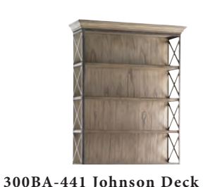
Overall: 45.25W x 15D x 57.25H in. Metal end panels; 3 stationary shelves Complements 300BA-450 Johnson File Chest Shown on pages: 6, 7, 10, 11