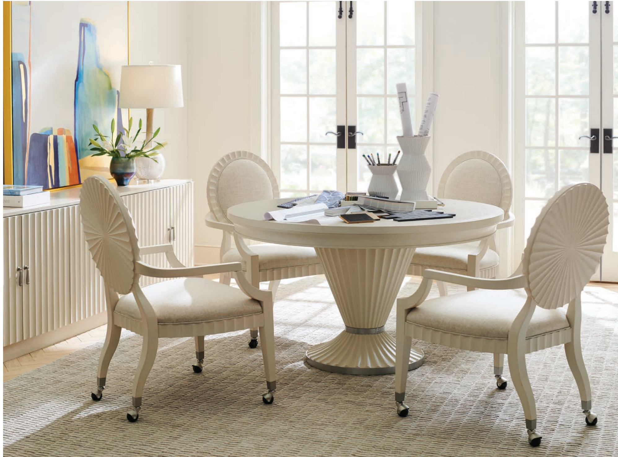
310-300C Artesia Game Table 54 diameter x 30H in.

The 54-inch diameter Artesia game table features a radial matched veneer pattern on the top with a tapered base that highlights the scalloped design detail. Note the brushed nickel accent trim at the base of the table.