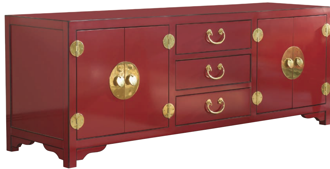
100SR-660 Pacific Isle Media Console 75W x 22.5D x 28H in.

The Pacific Isle console, featuring dramatic Pan-Asian hardware in polished brass, is offered in the Studio Red finish with black striping. There are two adjustable shelves behind each pair of doors and ample storage in the three center drawers.