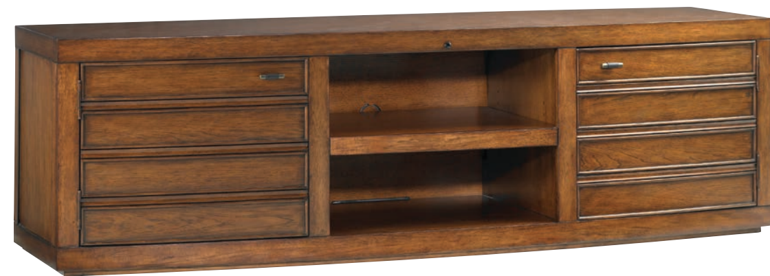
279LK-661 Spinnaker Point Media Console 78W x 22.25D x 23.25H in.