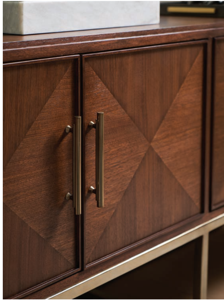
104-660 Cameron Media Console 67W x 17D x 30H in.

The Cameron media console showcases an elegant diamond pattern of quartered walnut veneer, in a rich dark walnut finish. The metal base is finished in burnished silver leaf. There is one adjustable shelf behind each pair of doors and a ventilated back panel.