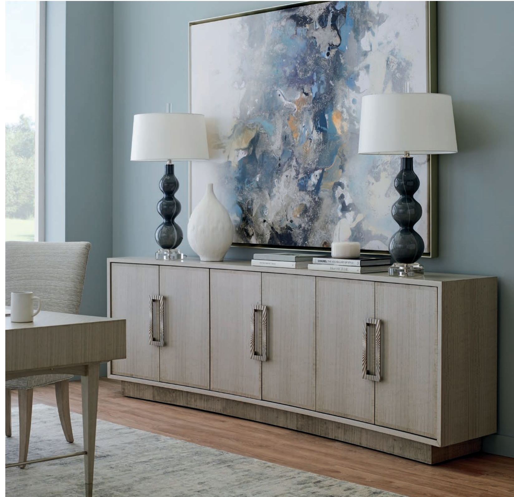
101-661 Donovan Long Media Console 100.5W x 18D x 34H in.

The sweeping concave design of the Donovan media console makes a strong contemporary statement. Crafted from Eucalyptus veneers with contrasting borders in a soft dove gray finish, the design features striking custom door pulls in brushed nickel. The 100-inch unit features six doors with six adjustable shelves and three storage drawers. The left and right facing drawers have removable felt liners and the center drawer is felt lined with partitions.