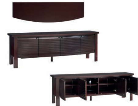
9726-1-UM Lumina Media Console 84.5W x 24D x 28H in. Umber Cherry finish. Bow front; 4 louvered doors; 4 adjustable shelves, media/component storage; five outlet surge suppressor; cord management; ventilation. Shown on page 53