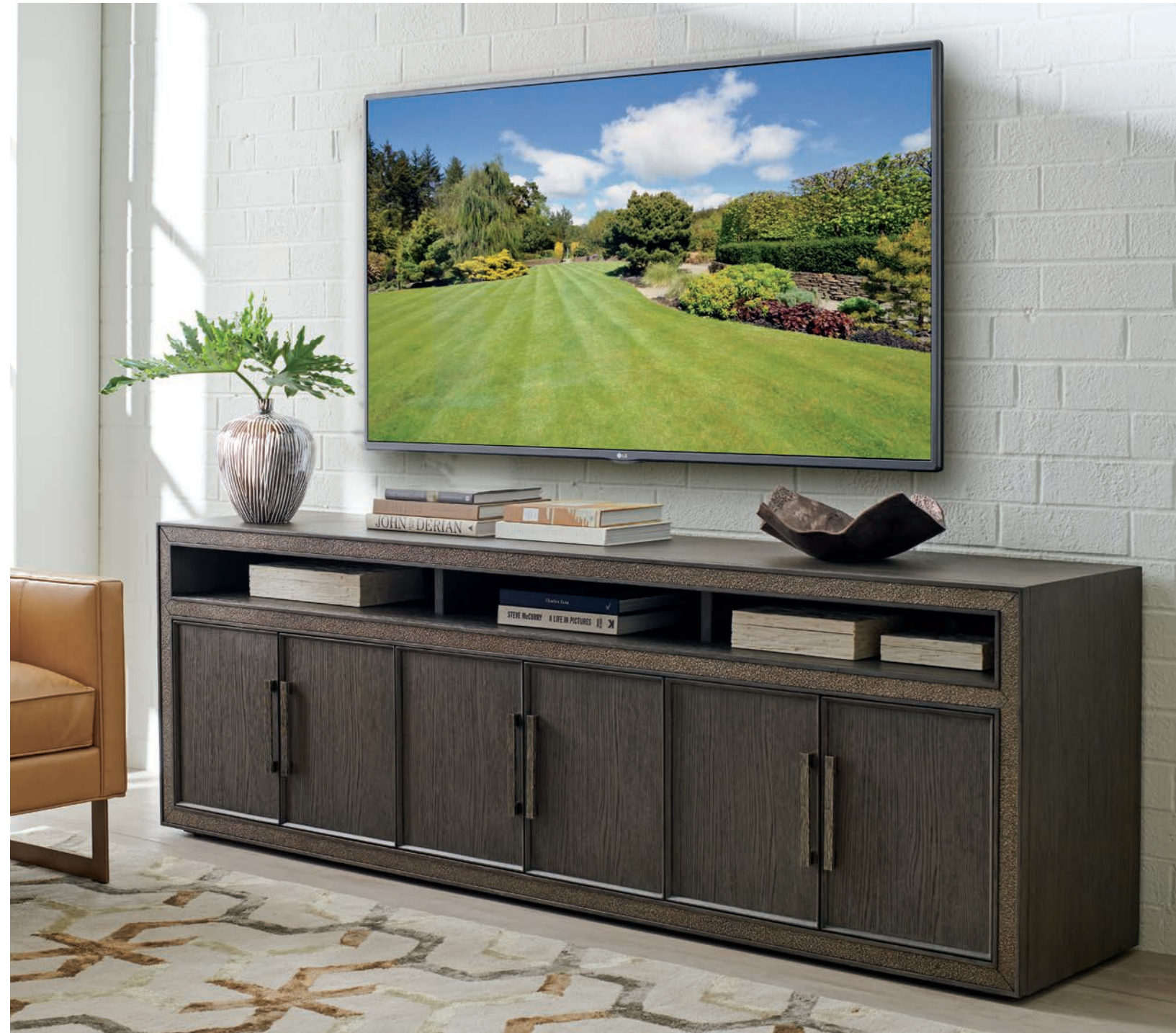
102-661 Hampton Long Media/Home Office Console 95.75W x 20D x 31H in.

The Hampton office and media console is designed to function both as a home office credenza or media console. It is crafted from sandblasted oak veneers in a rich graphite finish. A textured cast inlaid band frames the perimeter. Custom hardware and the textured inlay are finished in nickel with a dark glaze. The open compartment at the top accommodates a sound bar or book storage. The 96-inch version features six doors. Behind the right doors are three storage drawers. Behind the center doors are two adjustable shelves. Behind the left doors are a storage drawer and file drawer that accommodates letter or legal files.