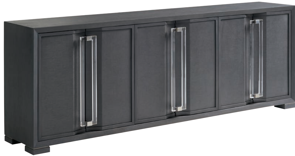
100LN-661 Anthology Long Linen Media Console 97.5W x 18D x 34H in. Linen wrapped case in a gray finish with stainless accents and custom designed acrylic hardware. 6 doors, 9 adjustable shelves, ventilated back

The Studio Designs portfolio is the largest collection within the Sligh assortment, encompassing a remarkable range of unique home office designs. Styling ranges from classic to coastal to contemporary. Materials include a variety of wood species and custom finishes, live-edge designs, decorative metal elements, and polished stainless steel. Every work space should reflect the unique style of the person using it, and the Studio Designs collection offers an exceptional look for every personality.