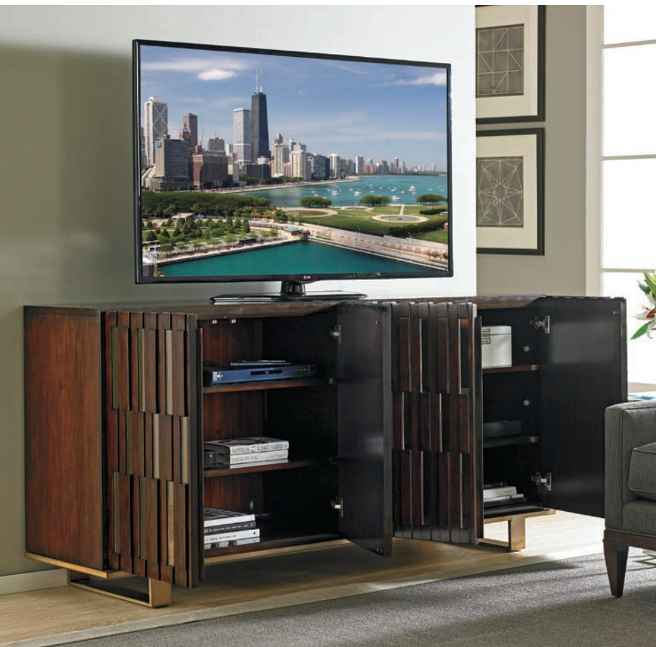
100WN-669 Quantum Media Console 75W x 20D x 36.25H in.

The Quantum media console offers a striking mid-century modern design crafted in Mahogany, with vertical bronze mirror accents on the doors and a brass finished metal base. There are two adjustable shelves behind each pair of doors on the front of the piece. The unit includes a 5-outlet surge protector.