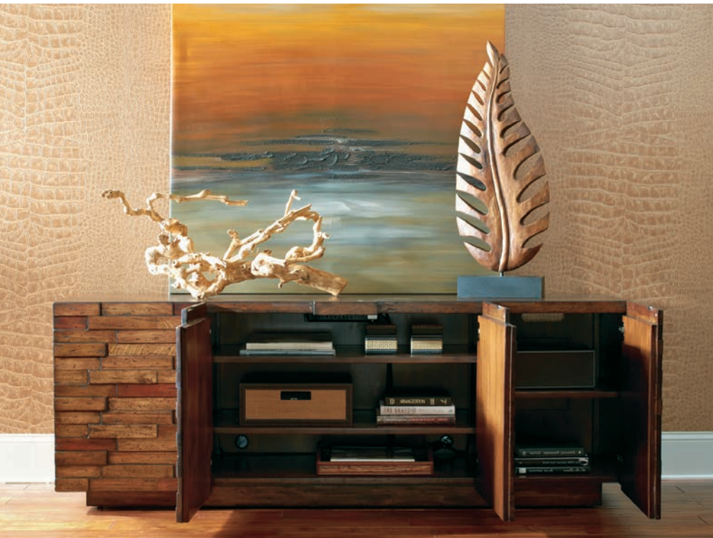
100NL-661 Criss Cross Media Console 72W x 20D x 26H in.

The Criss Cross console is a study in color, character and dimension. Offset blocks of Mahogany, Ash and Birch create an intriguing pattern that looks like contemporary art. There are two adjustable shelves behind the center doors, one adjustable shelf behind each of the outer doors and a five outlet surge protector.