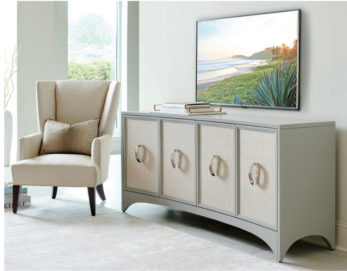
100RF-660 Newbury Park Raffia Media Console 78.25W x 20D x 34H in.

The Criss Cross console is a study in color, character and dimension. Offset blocks of Mahogany, Ash and Birch create an intriguing pattern that looks like contemporary art. There are two adjustable shelves behind the center doors, one adjustable shelf behind each of the outer doors and a five outlet surge protector.