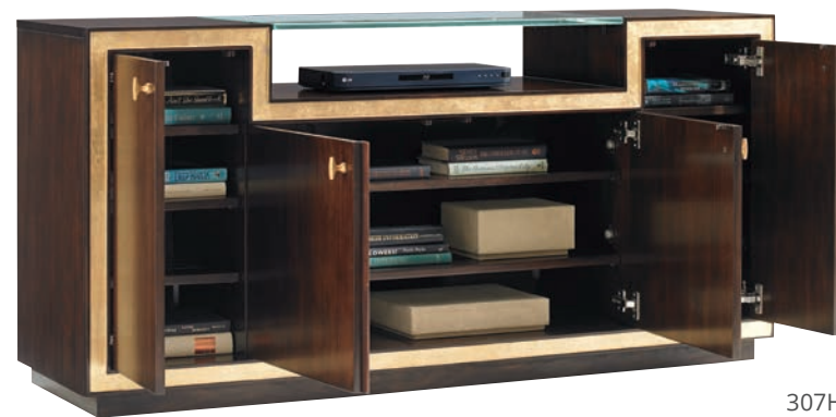
307HW-661 Palisades Media Console 64.5W x 18D x 31H in.

Exceptional media designs are crafted from walnut veneers with hand-applied gold leaf and rose gold hardware. The 65-inch wide Palisades media console offers concealed storage behind four doors, with an open compartment beneath an ultra-clear floating glass top. The 72-inch Rodeo media console on the opposite page offers three full extension drawers across the top and two ultra-clear glass shelves beneath.