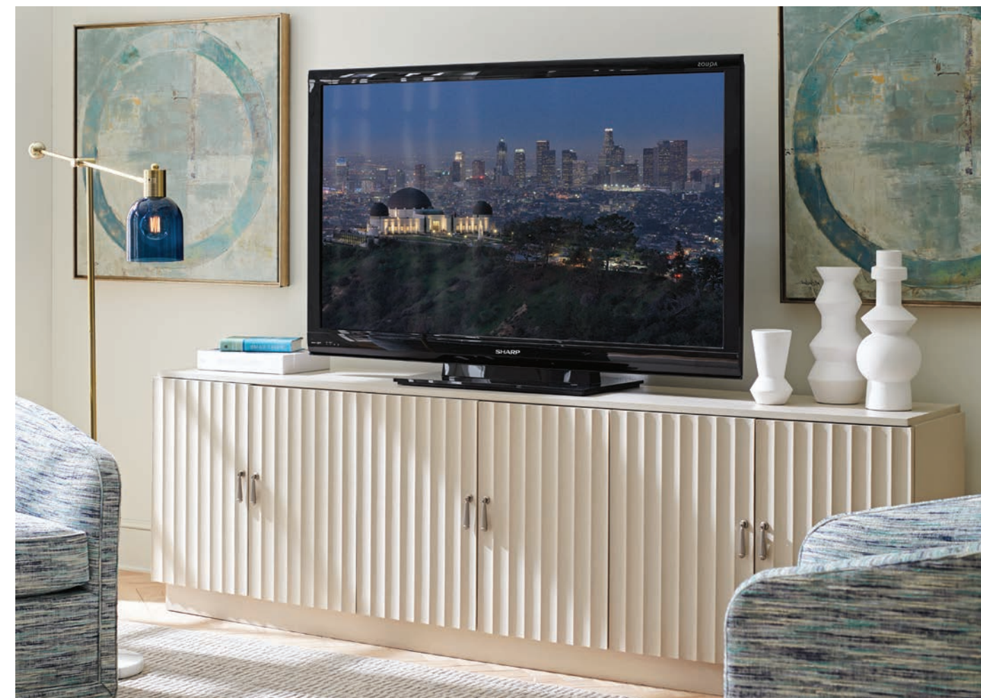
310-661 San Marcos Media Console 96.75W x 20D x 30H in.

The 65-inch Ellerston media console features an elegant bowfront design with 4 doors that showcase the scalloped detail. Behind the doors are 6 full-extension drawers and 6 adjustable shelves.