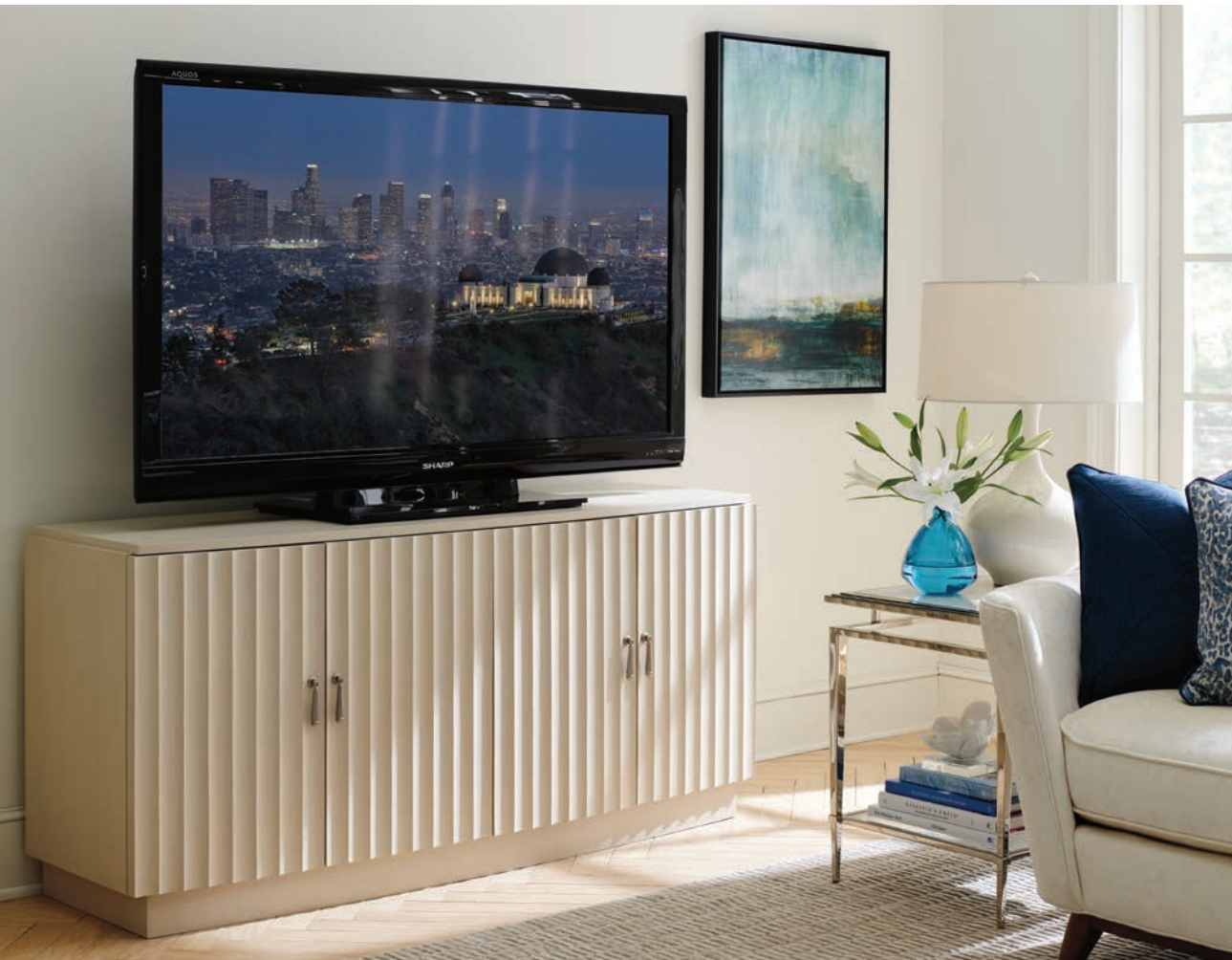
310-660 Ellerston Media Console 64.5W x 20D x 30H in.

Inspired by the timeless elegance of Hollywood Regency and Art Deco styling, designs in Cascades feature scalloped detailing that accentuates the graceful lines and curved fronts that define the distinctive look. Crafted from white oak veneers, pieces are lightly wire-brushed and finished in a fresh linen-white coloration, with custom hardware and ferrules in brushed nickel. The portfolio of designs includes desks, files chests and bookcases for the home office, media consoles in two sizes, and a game table with stationary and casted chairs.