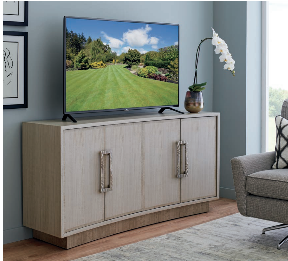
101-660 Donovan Media Console 68W x 18D x 34H in.

The 68-inch version of the Donovan media console has four doors with four adjustable shelves and two storage drawers. The left drawer is felt lined, and the right drawer is felt lined with partitions.