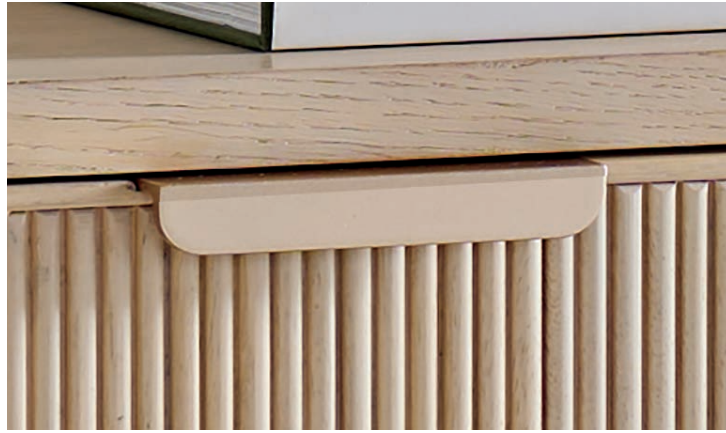
326-660 Montreux Media Console 83.75W x 17D x 30H in.

Montreux features bold contemporary lines, with touches of Mid-Century styling. Crafted from white oak in a light natural finish, designs showcase a vertical reeded motif and soft radius corners. Custom hardware is finished in an elegant champagne gold coloration.