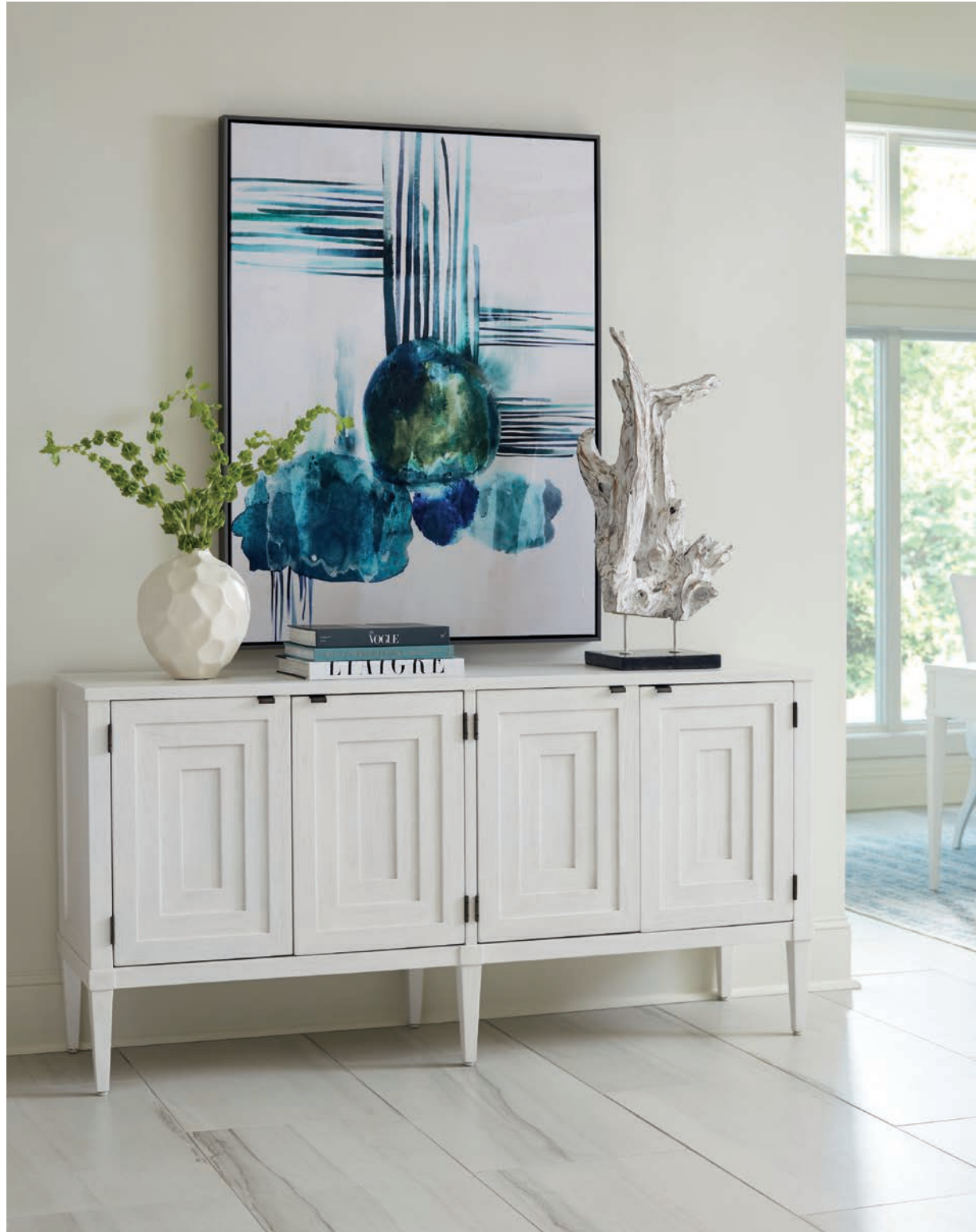
320-660 Clearwater Media Console 67.5W x 18D x 34H in.

The Sanibel collection is crafted from mahogany veneers and finished in an elegant shell white coloration for a refreshing coastal look. Designs feature a plantation shutter motif giving the collection a casual yet sophisticated aesthetic. Custom hardware, in aged pewter, offers a pleasing contrast to the painted finish.