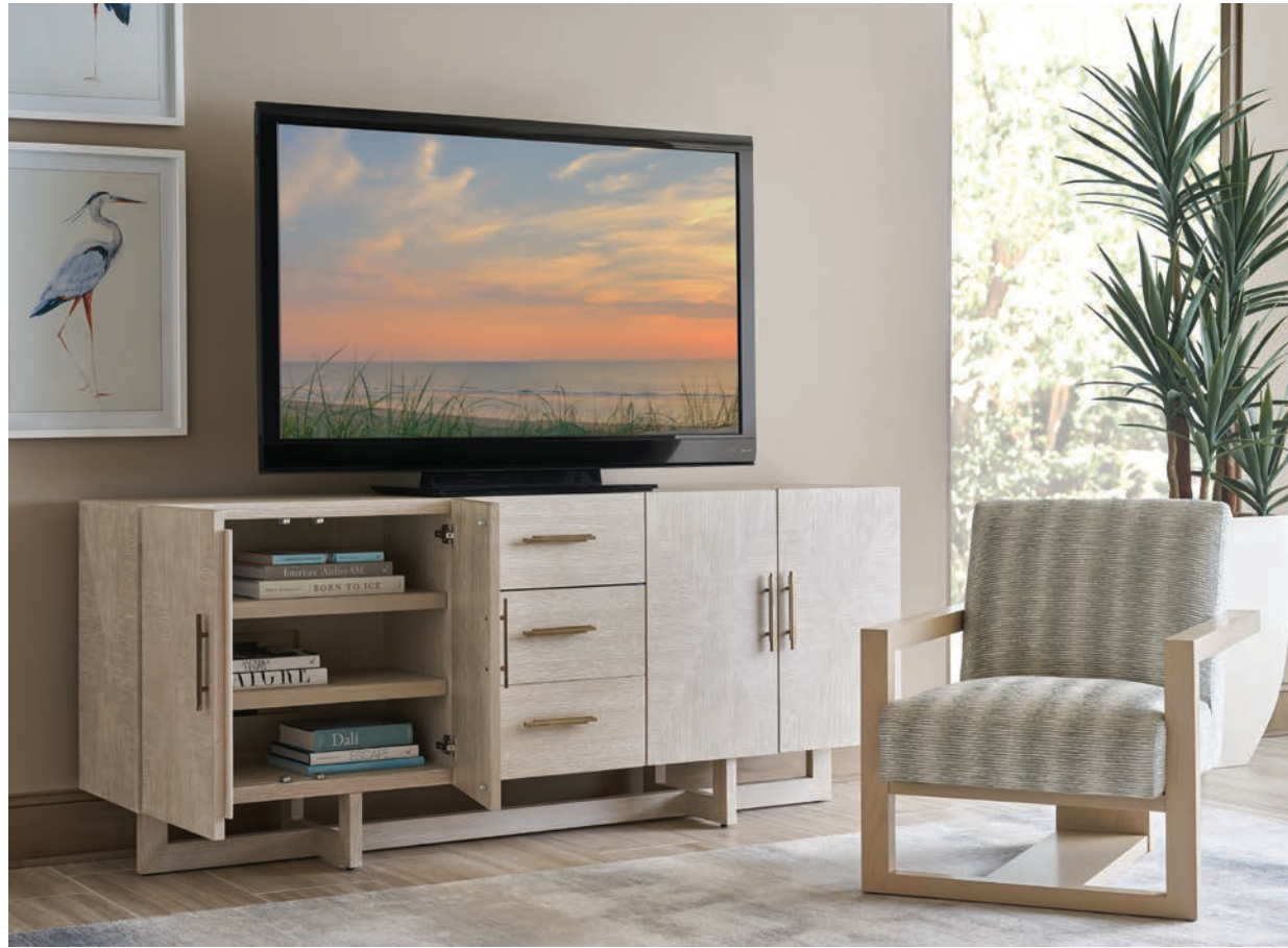
322-660 Sorenson Media Console 84W x 17D x 34H in.

The Silverstone collection is crafted from lightly sandblasted quartered white oak in a taupe finish with ivory ceruse to highlight the grain character. Custom hardware is finished in a rich champagne coloration. These same designs are available in a dark walnut finish in the Durango collection.