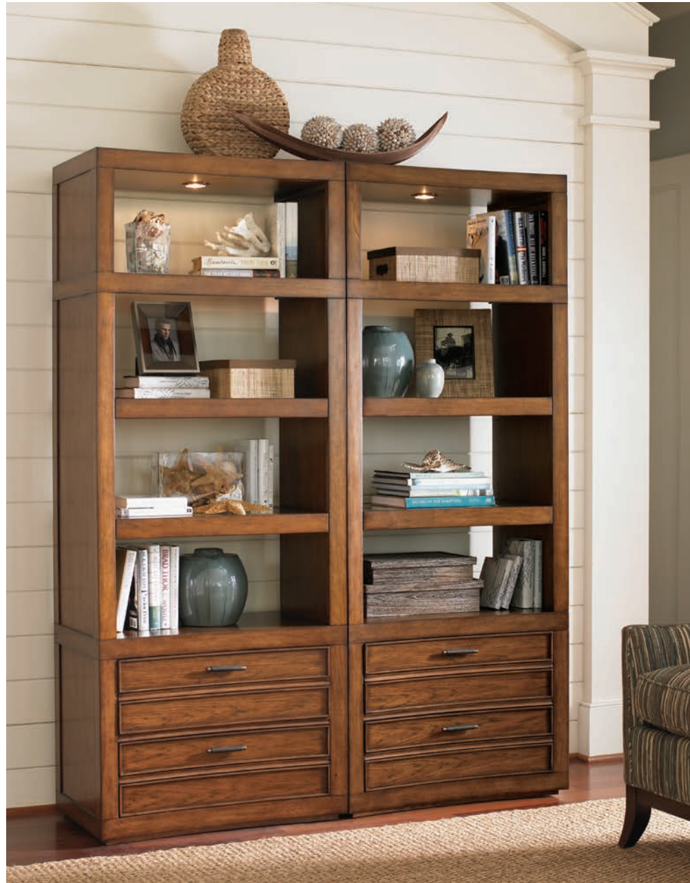
279LK-645 Crystal Sands Bookcase 30W x 18.5D x 77.5H in.

The image on the opposite page shows the 60-inch Plantation Bay TV console and bridge paired with Crystal Sands bookcases on either end. The overall width is 100-inches, offering a striking look with exceptional storage.