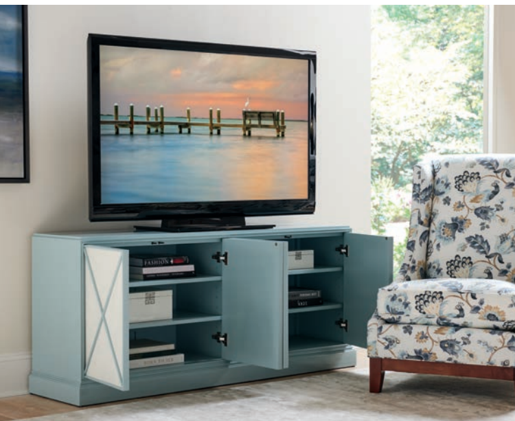
100XM-660 Rosalind Media Console 69.75W x 17.75D x 30.25H in.

The 70-inch Rosalind media console features a soft Tiffany blue painted finish with four contrasting faux shagreen doors, accented by a diamond fretwork design. Behind each pair of touch latch doors are two adjustable shelves.