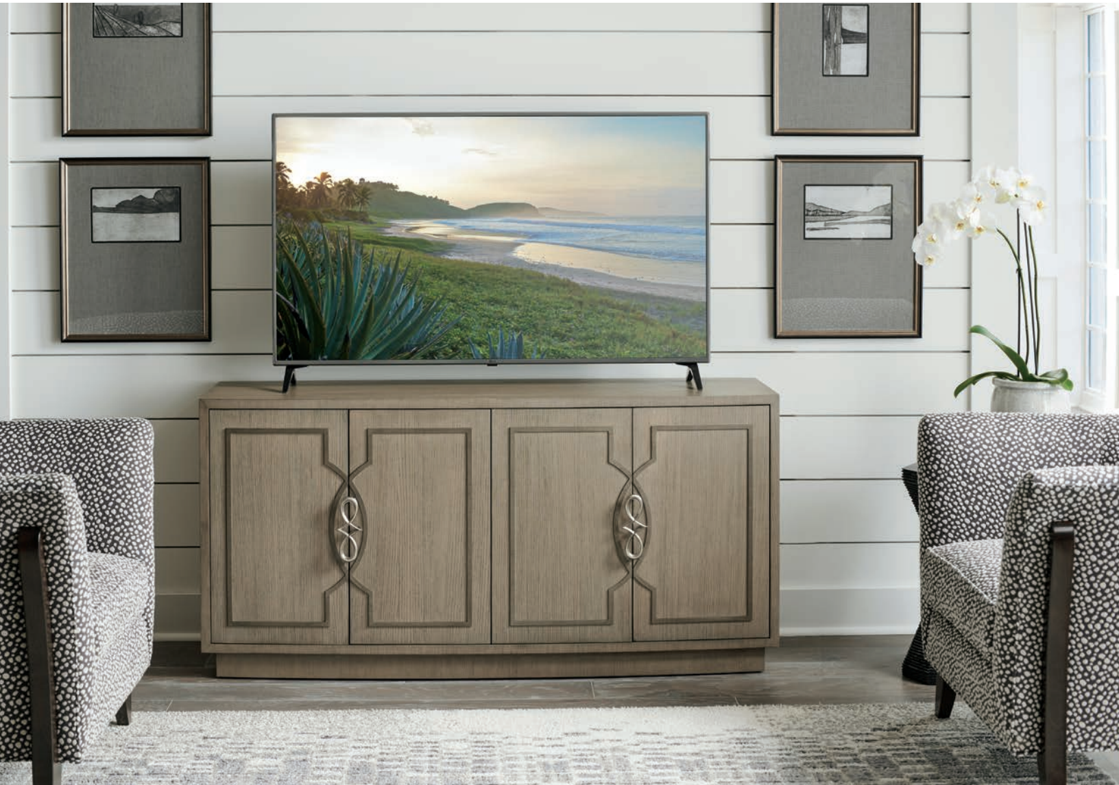
100SD-660 Grove Park Media Console 62W x 18D x 30H in.

This 62-inch console offers generous storage in a mid-size footprint. The neo-classical design features an elegant curved front, crafted from quartered ash veneers, in a wire-brushed dove gray finish. The interlocking molding design frames signature door hardware. Behind each pair of doors is a storage drawer and two adjustable shelves.