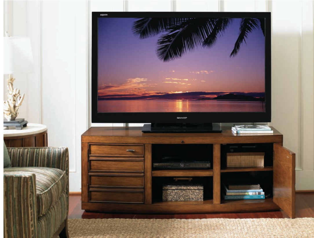
279LK-660 Plantation Bay Media Console 60W x 21.25D x 23.25H in.

The casual yet sophisticated styling of Longboat Key is born of clean contemporary lines, bold architectural details, and a warm sundrenched Sienna finish. Crafted from Hickory veneers, designs feature distinctive metal accents and custom brass hardware wrapped with faux leather.