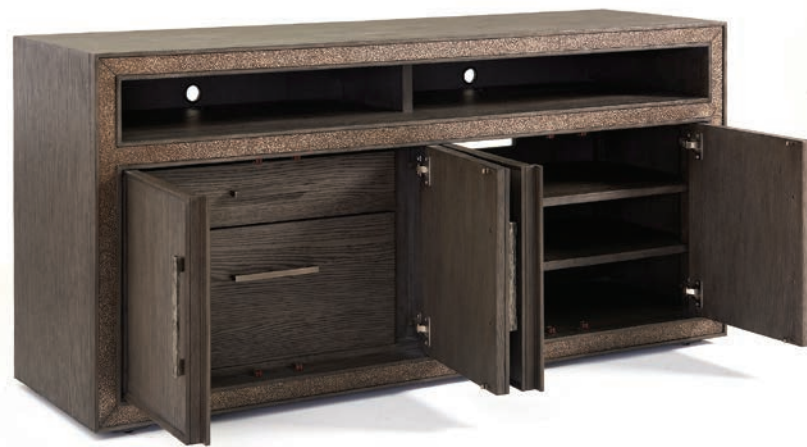
102-660 Hampton Media/ Home Office Console 65.5W x 20D x 31H in. The 66-inch version of the Hamptons office and media console features four doors. Behind the left doors are a storage drawer and a file drawer that will accommodate letter or legal files. Behind the right doors are two adjustable shelves.

The Hampton office and media console is designed to function both as a home office credenza or media console. It is crafted from sandblasted oak veneers in a rich graphite finish. A textured cast inlaid band frames the perimeter. Custom hardware and the textured inlay are finished in nickel with a dark glaze. The open compartment at the top accommodates a sound bar or book storage. The 96-inch version features six doors. Behind the right doors are three storage drawers. Behind the center doors are two adjustable shelves. Behind the left doors are a storage drawer and file drawer that accommodates letter or legal files.