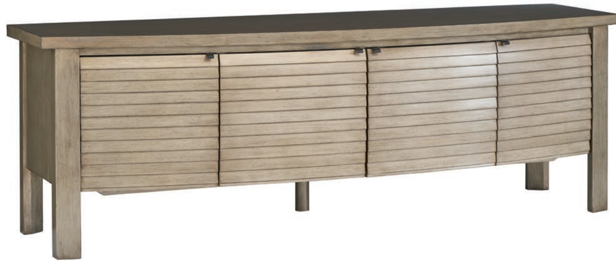
9726-1-AP Lumina Media Console 84.5W x 24D x 28H in.

The Lumina console has a graceful bow front louvered design motif. It is offered in your choice of the Antique Pewter or Umber Cherry finish and is available in both 58-inch and 84-inch lengths. The 58-inch design has two louvered doors, and the 84-inch design has four louvered doors. Behind each door is an adjustable shelf and each unit includes a five-outlet surge protector.