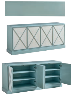
100XM-660 Rosalind Media Console 69.75W x 17.75D x 30.25H in. Transitional design crafted from select hardwoods in a soft pale blue finish. 4 touch latched doors with contrasting faux shagreen fronts and decorative diamond fretwork, 6 adjustable shelves, ventilated backs. Plinth base. Shown on page 42