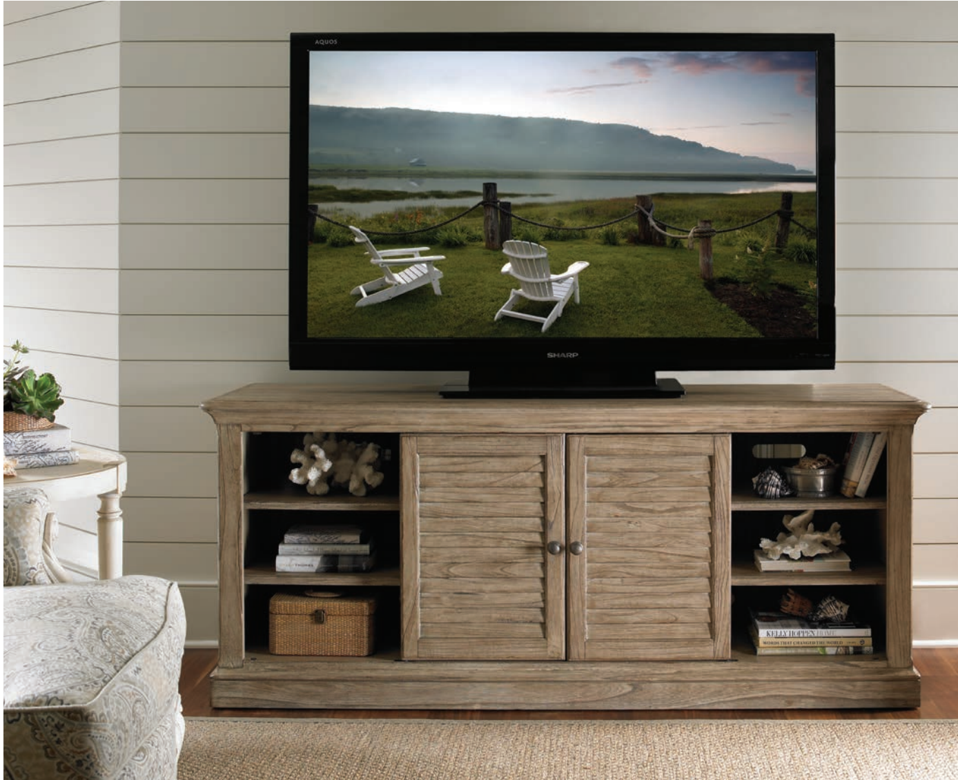
300BA-660 Travis Media Console 64W x 22D x 30.25H in.

Barton Creek offers striking transitional lines in a weathered gray driftwood finish, accented by antique pewter hardware. The Travis console is 64-inches. It features shutter doors that pivot 180 degrees to conceal the center or the end compartments. The center area has a storage drawer at the bottom with two adjustable shelves above. The end compartments each have two adjustable shelves.