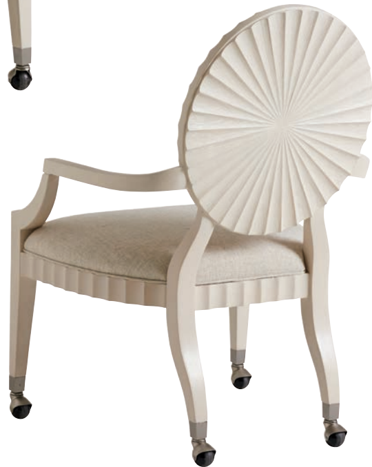
310-938-01 Preston Game Chair with Casters 26.25W x 26D x 40H in.

The Preston game chair with casters offers a great pairing for the Artesia game table. The upholstered inside back and seat are standard in fabric 2221-11 Chatfield, which is a wheat-colored indoor performance fabric featuring a linen weave and a soft hand. The casters are finished in brushed nickel.