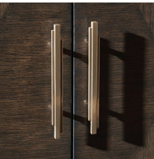
321-660 Sorenson Media Console 84W x 17D x 34H in.

The Sorenson media console features a striking diamond match veneer pattern on the door and end panels, and a unique open architectural base design that gives the piece a floating appearance. Custom-designed door and drawer pulls are finished in a rich champagne gold coloration. There are three soft-closing storage drawers in the middle, and two adjustable shelves behind each pair of doors.