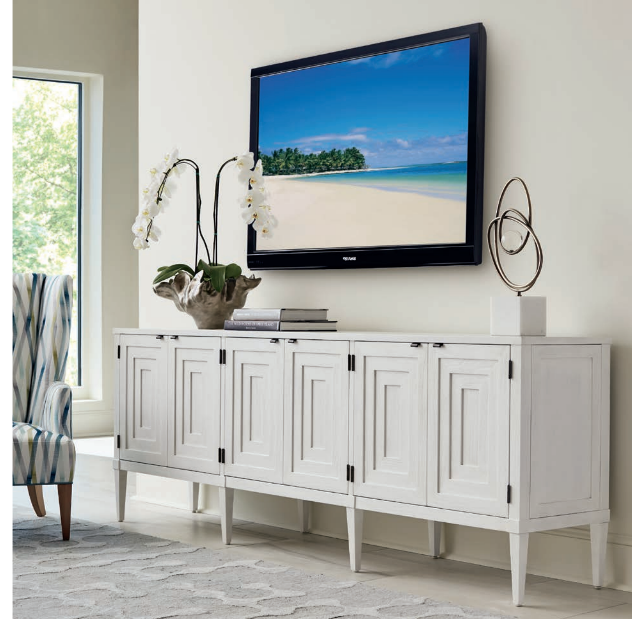
320-661 Clearwater Long Media Console 99.75W x 18D x 34H in.

The Clearwater series is inspired by the Ocean Breeze collection from Tommy Bahama Home. Designs are crafted from quartered mahogany veneers in an elegant shell white finish. The step-down molding in the doors adds dimension to the front of the piece. The 68-inch version features four doors. Behind each pair of doors are two adjustable shelves.