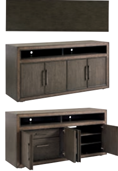
102-660 Hampton Media/Home Office Console 65.5W x 20D x 31H in. Transitional design in a graphite finish crafted from heavily sandblasted quartered oak veneers, with striking custom hardware in a nickel finish with a dark glaze. Textured cast inlay, partitioned open compartment for sound bar storage, and grommet for cord management. Four doors. Ventilating back. Behind left side facing doors: One storage drawer and one file drawer that will accommodate legal or letter files Behind right side facing doors: Two adjustable shelves Open compartments between partition 29.75W x 19.25D x 5H in. Sound bar compartment 60.75W x 5.75D x 5H in. Shown on page 46