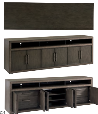
102-661 Hampton Long Media/Home Office Console 95.75W x 20D x 31H in. Transitional design in a graphite finish crafted from heavily sandblasted oak veneers, with striking custom hardware in a nickel finish with a dark glaze. Textured cast inlay, partitioned open compartment for sound bar storage, and grommet for cord management. Six doors, ventilated back. Behind left side facing doors: One storage drawer and one file drawer that will accommodate legal or letter files Behind center doors: Two adjustable shelves Behind right side facing doors: Three full extension drawers Open compartments between partition 29.75 x 19.25 x 5H in. Sound bar compartment 91.25W x 5.75D x 5H in. Shown on page 47