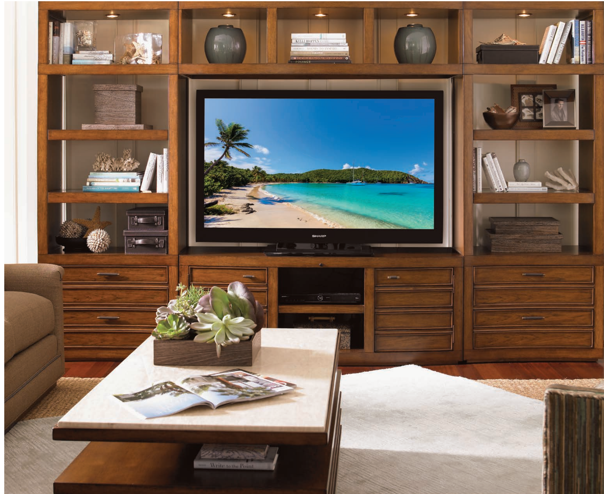
279LK-660 Plantation Bay Media Console 60W x 21.25D x 23.25H in.