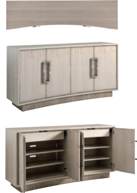
101-660 Donovan Media Console 68W x 18D x 34H in. Dramatic contemporary design featuring concave shaping, with Eucalyptus veneers in a dove gray finish with contrasting tone borders, and custom brushed nickel hardware. Four doors, two drawers (left side facing drawer has removable felt pad, right side facing drawer is felt lined and divided), four adjustable shelves, ventilated removable back panel, and partition routed for cord management. Shown on page 44