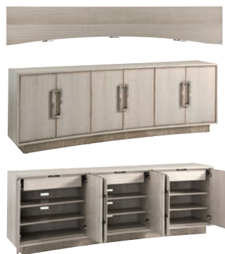
101-661 Donovan Long Media Console 100.5W x 18D x 34H in. Dramatic contemporary design featuring concave shaping, with Eucalyptus veneers in a dove gray finish with contrasting tone borders, and custom brushed nickel hardware. Six doors, three drawers (left side facing drawer has removable felt pad, right side facing drawer is felt lined and divided), six adjustable shelves, ventilated removable back panel, and partition routed for cord management. Shown on page 45