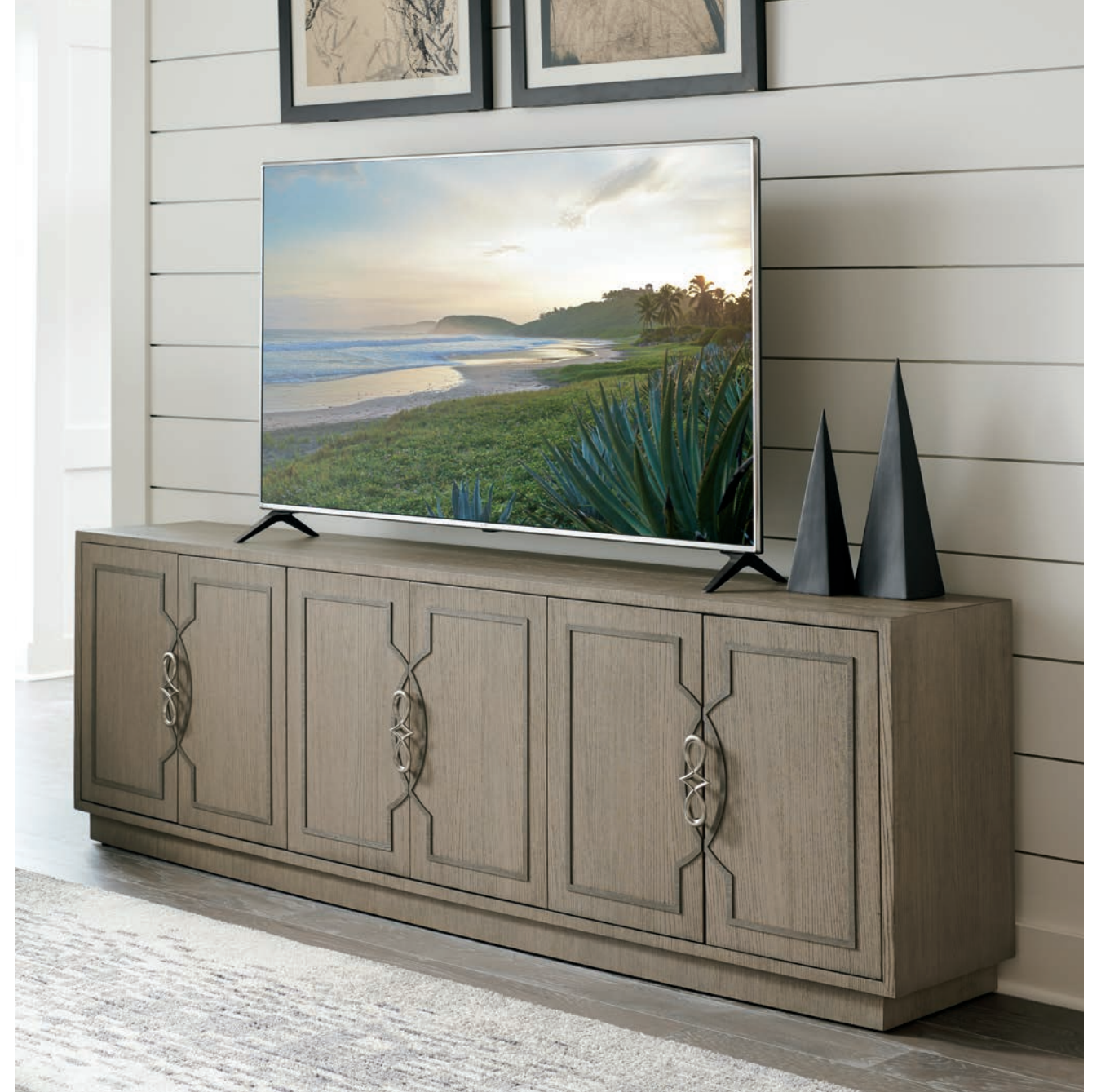
100SD-661 Grove Park Long Media Console 92W x 18D x 30H in.

This 92-inch console makes a grand statement and accommodates the largest of today's monitors. The neo-classical design features an elegant curved front, crafted from quartered ash veneers, in a wire-brushed dove gray finish. The interlocking molding design frames signature door hardware. Behind each pair of doors is a storage drawer and two adjustable shelves.