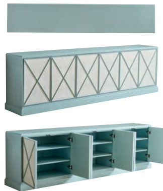
100XM-661 Rosalind Long Media Console 103W x 17.75D x 30.25H in. Transitional design crafted from select hardwoods in a soft pale blue finish. 6 touch latched doors with contrasting faux shagreen fronts and decorative diamond fretwork, 9 adjustable shelves, ventilated backs. Plinth base. Shown on page 43