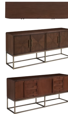
104-660 Cameron Media Console 67W x 17D x 30H in. Contemporary designs crafted from quartered walnut veneers and select hardwoods in a dark walnut finish. Metal base in a warm silver leaf finish, four doors, 1 adjustable shelf behind each pair of doors, ventilated back, and cord management. Shown on pages 48 and 49