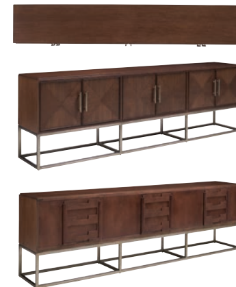
104-661 Cameron Long Media Console 100.25W x 17D x 30H in. Contemporary designs crafted from quartered walnut veneers and select hardwoods in a dark walnut finish. Metal base in a warm silver leaf finish, six doors, 3 adjustable shelves, ventilated back, and cord management. Shown on pages 50 and 51