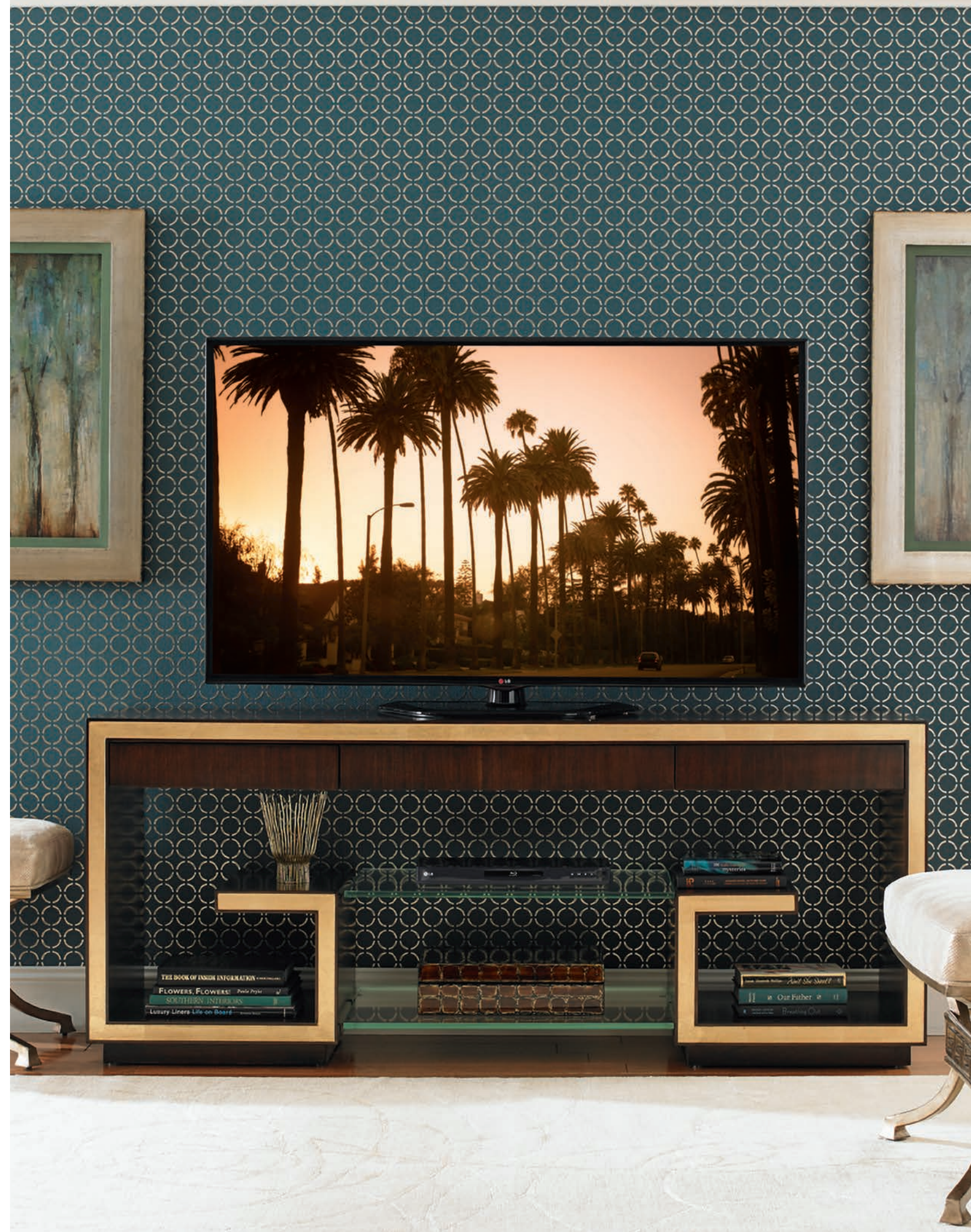
307HW-660 Rodeo Media Console 72W x 18D x 30H in.

Exceptional media designs are crafted from walnut veneers with hand-applied gold leaf and rose gold hardware. The 65-inch wide Palisades media console offers concealed storage behind four doors, with an open compartment beneath an ultra-clear floating glass top. The 72-inch Rodeo media console on the opposite page offers three full extension drawers across the top and two ultra-clear glass shelves beneath.