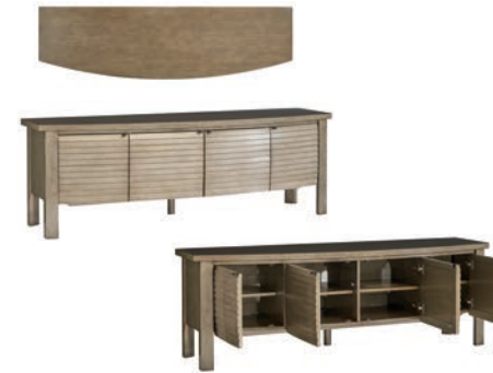
9726-1-AP Lumina Media Console 84.5W x 24D x 28H in. Antique Pewter finish. Bow front; 4 louvered doors; 4 adjustable shelves, media/component storage; five outlet surge suppressor; cord management; ventilation. Shown on page 52