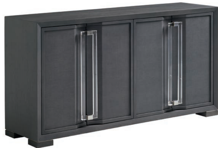
100LN-660 Anthology Linen Media Console 66W x 18D x 34H in. Linen wrapped case in a gray finish with stainless accents and custom designed acrylic hardware. 4 doors, 6 adjustable shelves, ventilated back