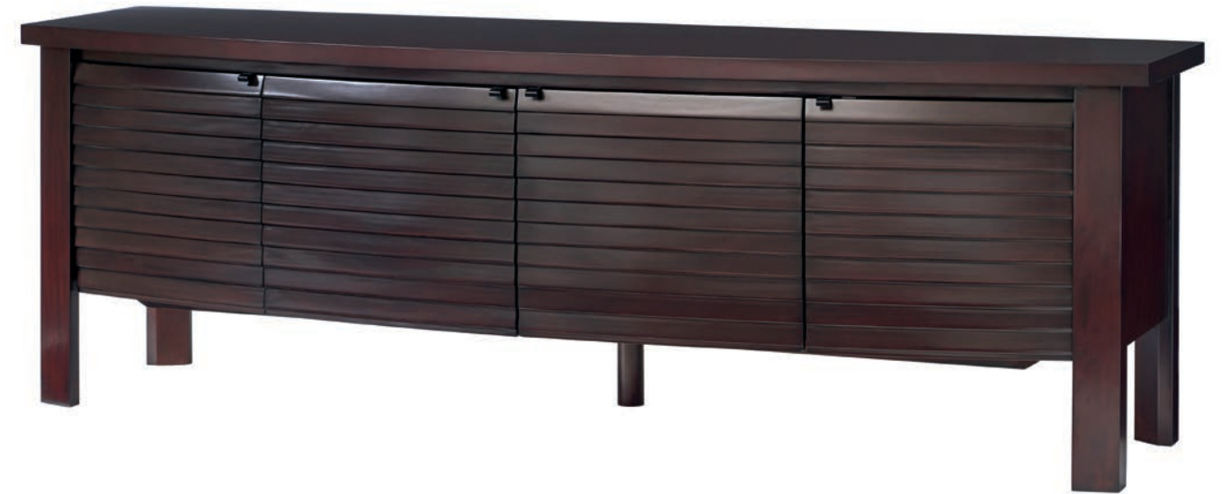
9726-1-UM Lumina Media Console 84.5W x 24D x 28H in.