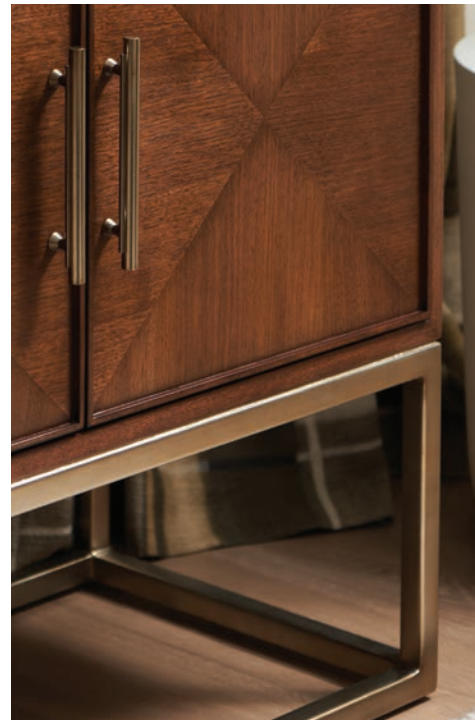
104-661 Cameron Long Media Console 100.25W x 17D x 30H in. The Cameron media console showcases an elegant diamond pattern of quartered walnut veneer, in a rich dark walnut finish. The metal base is finished in burnished silver leaf. There is one adjustable shelf behind each pair of doors and a ventilated back panel.