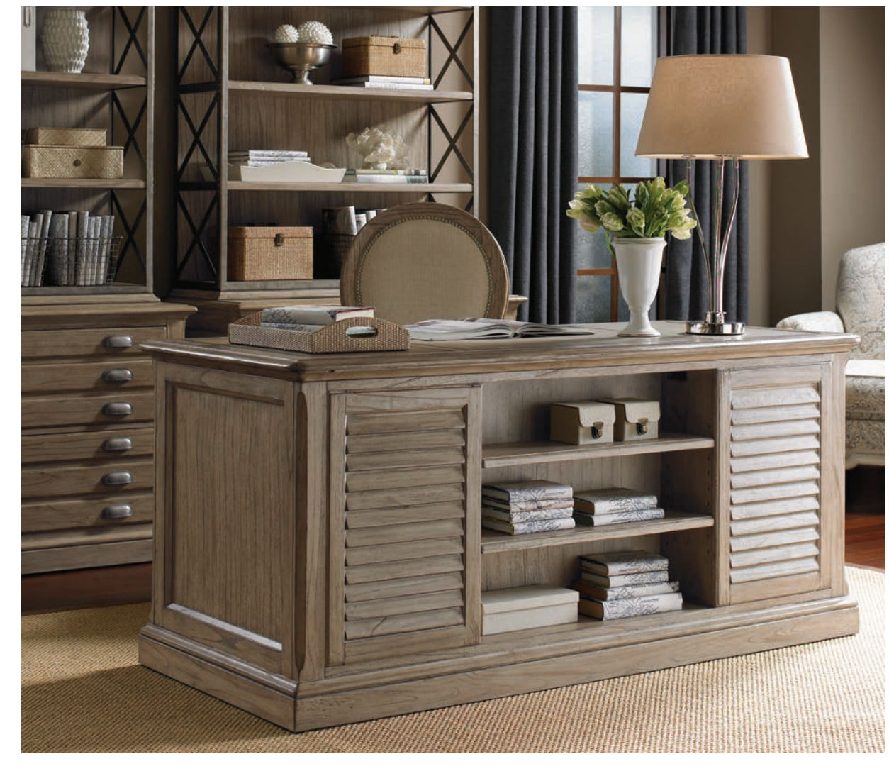
300BA-411 Austin Desk 66W x 30D x 30H in.

The back of the Austin desk features a plantation shutter design flanking two adjustable shelves. The working side includes a drop-front center drawer with ergonomic palm rest, four storage drawers, and two file drawers. The writing surface has three custom inserts in a sophisticated gray leather.