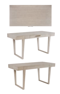
322-410 Revington Writing Desk 60W x 30D x 29.5H in. Knee space 39W x 24.25H in. Tapered open pedestal legs, quartered oak wooden top, one full-extension storage drawer. Shown on pages 22 and 23