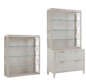
250-441 Octavia Deck 47.5W x 14.25D x 54H in. Complements the 450 Octavia File Chest Decorative laser cut wooden fretwork on end panels, 3 adjustable ultra clear tempered glass shelves, touch LED lighting. Shown on pages 32, 33 and 35