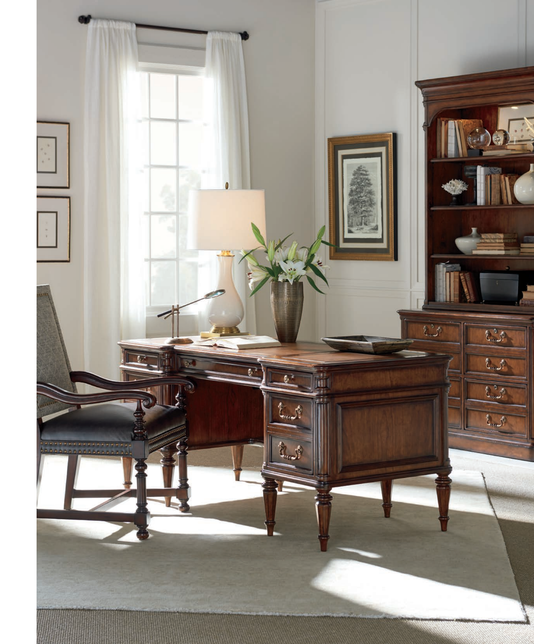
305-402 Wesley Desk 66W x 30D x 30H in.