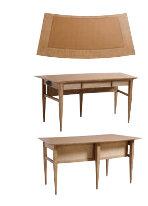
100FL-410 Aegis Writing Desk 63.5W x 30.5D x 29.5H in. Knee space 44W x 24.5H in. Transitional radial shaped writing desk crafted from select hardwoods and white oak veneers in a wirebrushed light brown finish. 3 storage drawers and modesty panel with contrasting woven cane panels. Five tapered legs and faux leather writing surface. Mounted 2 powered USB power jacks with tamper resistant receptacles and cord management. Shown on page 82