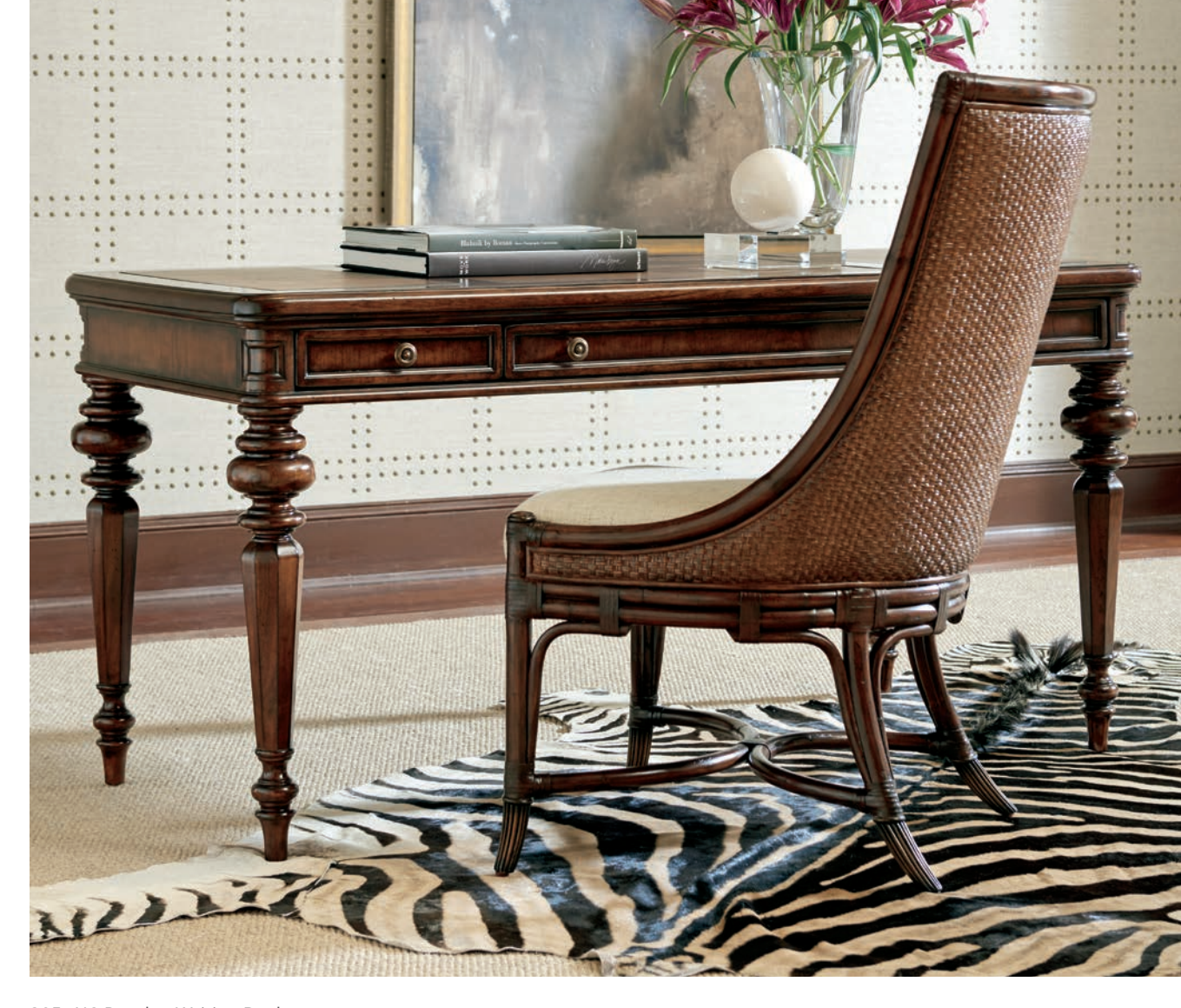
305-412 Rosslyn Writing Desk 60W x 28D x 30H in.