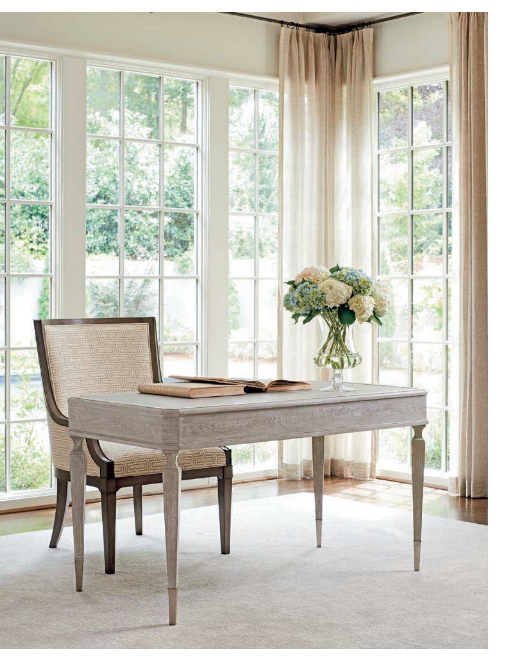
The 54-inch Chloe writing desk offers an elegant design that works equally well in a dedicated home office or in a bedroom work space. It features three storage drawers, metal ferrules in a brushed nickel finish and a writing surface of gray Brisa leather.

250-412 Chloe Writing Desk 54W x 28D x 30H in. 1577-13 Aqua Bay Chair 27W x 29D x 41H in.