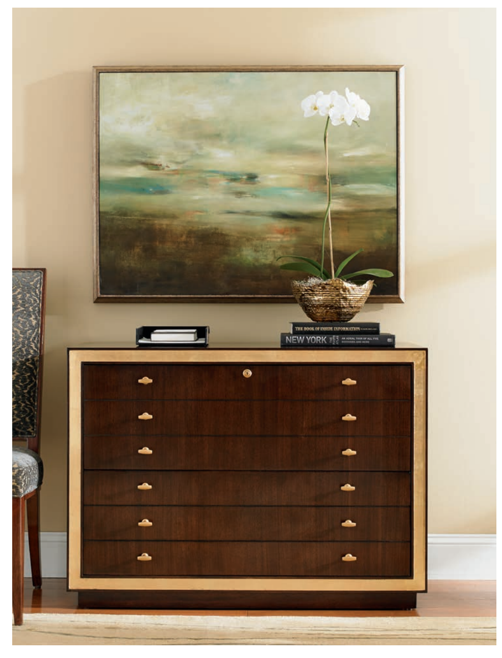
307HW-450 Beverly Palms File Chest 44W x 21D x 32H in.

Inspired by the timeless Greek Key design, Bel Aire's fresh contemporary styling sets the tone for the most elegant interiors. Exceptional office and media designs are beautifully crafted in Walnut, rewarding the discerning eye with accents of hand-applied gold leaf for a distinctive statement of style.