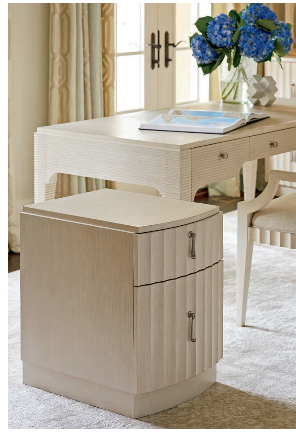
310-452 Ramsey Mobile Single File Chest 17.75W x 22D x 24H in.

The 46-inch Birkdale file chest features two full-extension locking file drawers that accommodate letter or legal files. The deck features three adjustable glass shelves, touch LED lighting, and metal accents in brushed nickel. The smaller Ramsey mobile file chest offers a full-extension storage drawer at the top and a file drawer beneath.