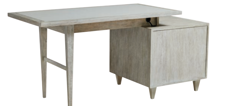
100CD-410 Domus Writing Desk 64W x 26D x 29.75H in.

The contemporary offset design of the 64-inch Domus writing desk is crafted from quartered oak veneers in a sandblasted and wire-brushed light gray finish with custom brushed nickel hardware. The drawer box on the left side features a concave geometric design with a storage drawer above and a file drawer below that will accommodate letter or legal files. The inset Brisa leather writing surface is both durable and cleanable, and the desk incorporates an integrated power unit with two USB jacks and two receptacles.