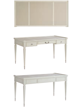
100AM-410 Fremont Writing Desk 58.75W x 28.75D x 30.75H in. Knee space 25W x 25H in. Maple veneers and select hardwoods in a smooth ivory finish with custom hardware in a polished nickel finish. Leather writing surface, 3 full extension drawers, removable dictation panel will work in either left or right side facing drawers, metal ferrules in a polished nickel finish.