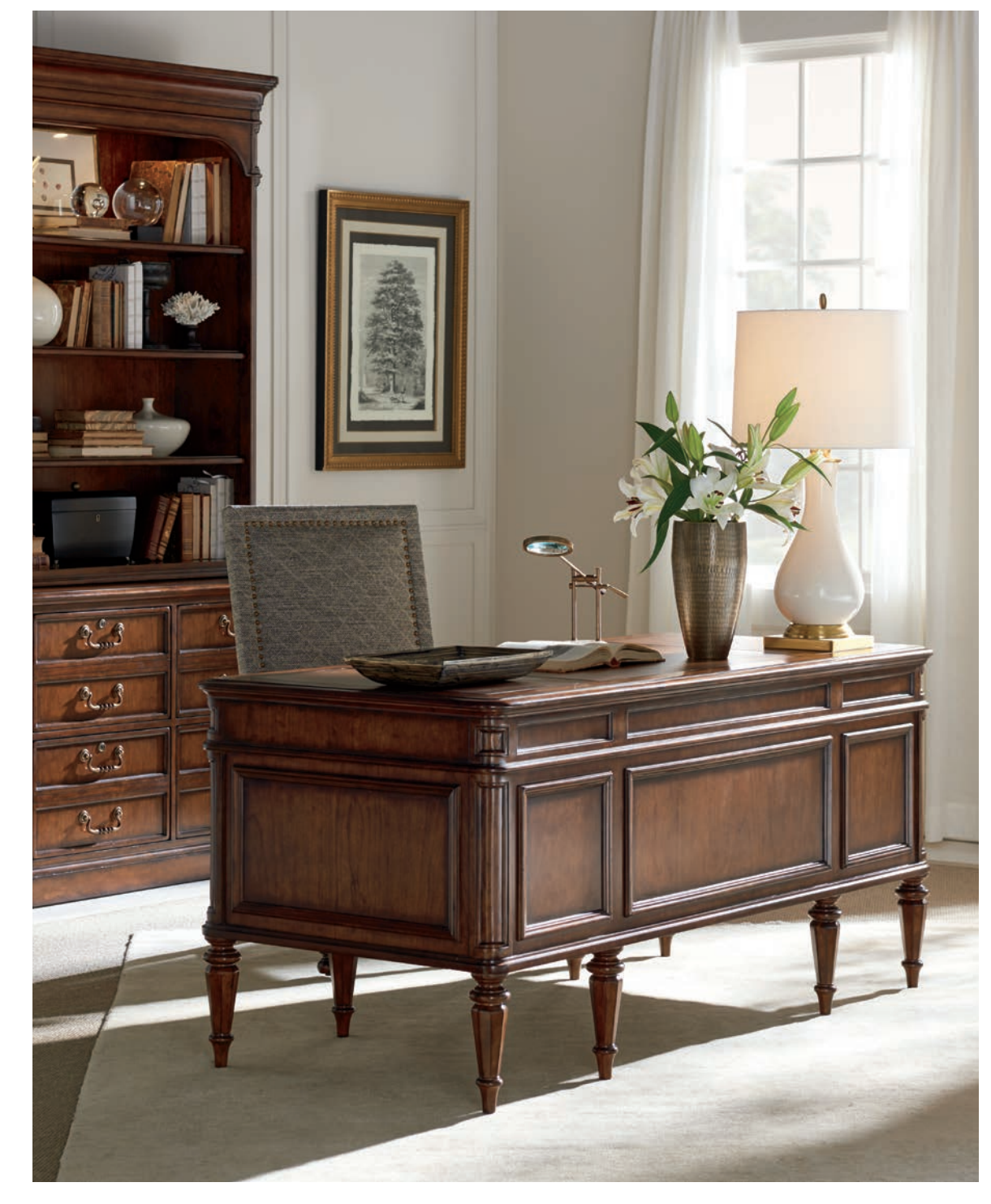
With a 66 \times 30 -inch writing surface, the Wesley kneehole desk offers an elegant combination of form and function. The top of the desk features a Brisa leather writing surface with decorative tooling. The left and right sides have a full-extension self-closing drawer at the top and a full-extension file drawer below that will accommodate letter or legal files. The center drawer has a drop-front to accommodate a keyboard. There is a hidden storage shelf in the bottom section of the interior compartment.

Traditional designs in Richmond Hill are crafted from select cherry veneers, featuring classic styling elements like fluted posts, elegant tapered legs, inverted breakfront designs and raised panel moldings. The warm cherry finish exudes a distinctive air of sophistication, with light distressing on surfaces and gentle burnishing on edges and corners. The hardware is finished in a rich, aged brass coloration.