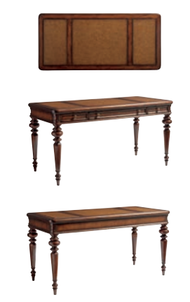
305-412 Rosslyn Writing Desk 60W x 28D x 30H in. 3 full extension self closing drawers, faux leather writing surface. Shown on page 53