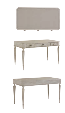
250-412 Chloe Writing Desk 54W x 28D x 30H in. Faux leather top, 3 drawers (removable pencil tray in center drawer). Partitioned leather drawer box that can be used in left or right side facing drawers. Metal ferrules in a brushed nickel finish. Some assembly required Shown on page 34