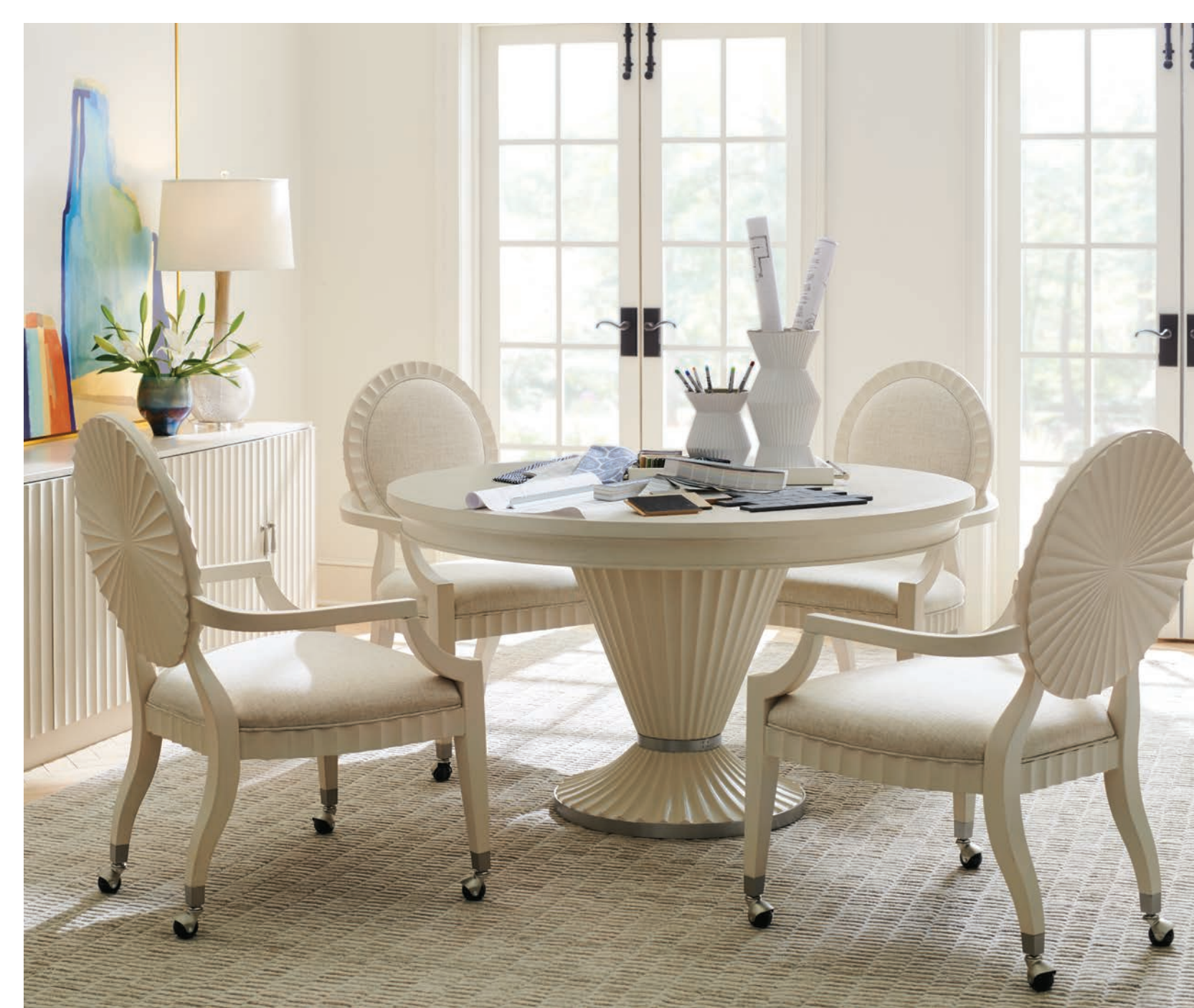
310-300C Artesia Game Table 54 diameter x 30H in.