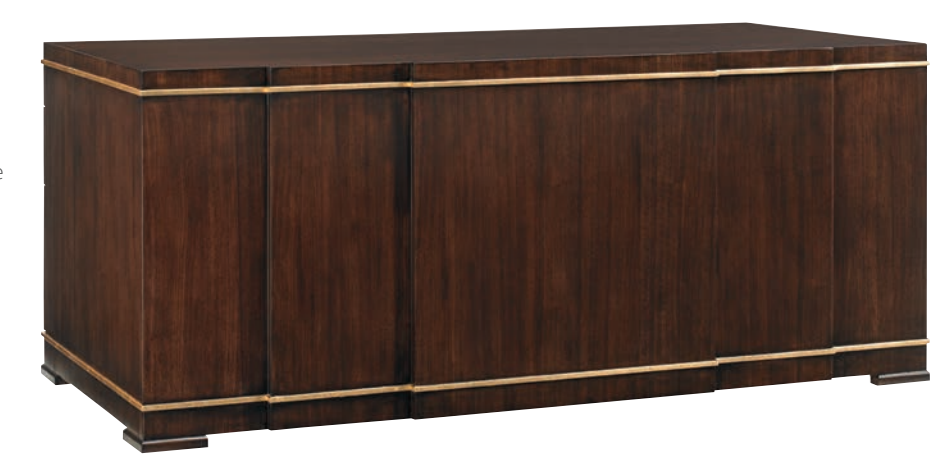
The Paramount executive desk blends striking contemporary design with full extension drawers, locked filing, generous storage and wire management. The horizontal accents at the top and base are finished with hand-applied gold leaf.

The Beverly Palms file chest and deck offer elegant supplemental filing, storage and display. The file chest features two extension file drawers with a lock on the top drawer. The deck has a gold leaf back panel behind three adjustable glass shelves with touch lighting.