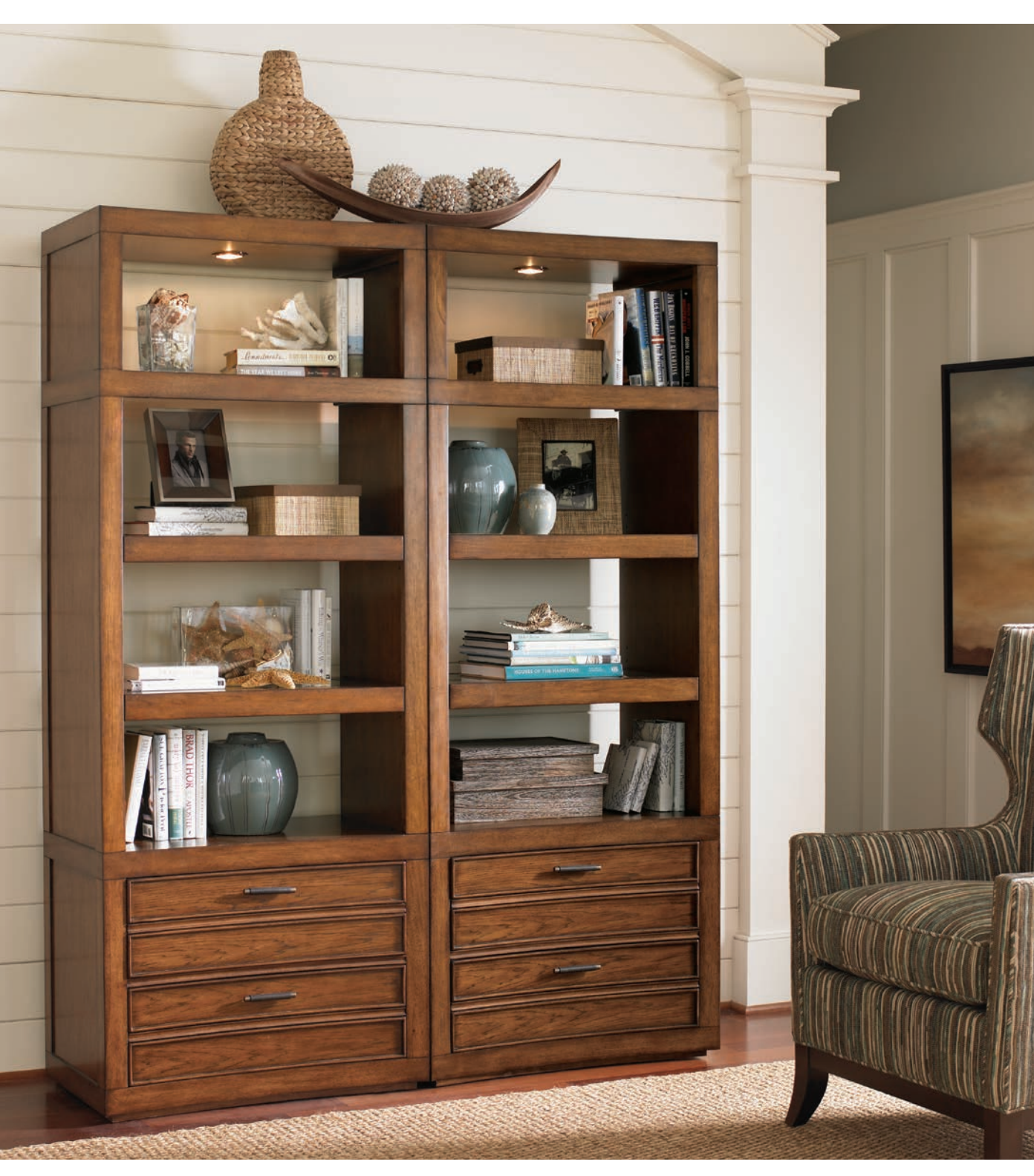
279LK-645 Crystal Sands Bookcase 30W x 18.5D x 77.5H in.

The 30-inch Crystal Sands bookcases pair beautifully because of their concave fronts. The design features two adjustable shelves and one stationary shelf at the top, with glass inserts and recessed lighting. The base includes two generous storage drawers.