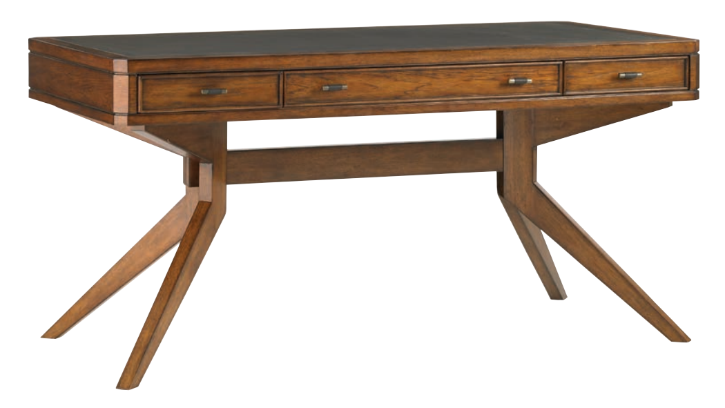
279LK-410 Lido Shores Desk 60W x 31D x 30H in.

The casual yet sophisticated styling of Longboat Key is born of clean contemporary lines, bold architectural details, and a warm sundrenched Sienna finish. Crafted from Hickory veneers, designs feature distinctive metal accents and custom brass hardware wrapped with faux leather.