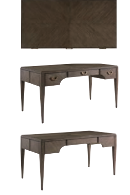
103-410 Bennett Writing Desk 60W x 30.75D x 29.5H in. Knee space 25.25W x 24.5H in. Traditional design crafted from deeply sandblasted quartered oak veneers in a classic Falcon brown finish with gray undertones with custom hardware in a champagne finish. Three storage drawers, left and right side facing drawers have removable storage boxes with partitions. Shown on page 80