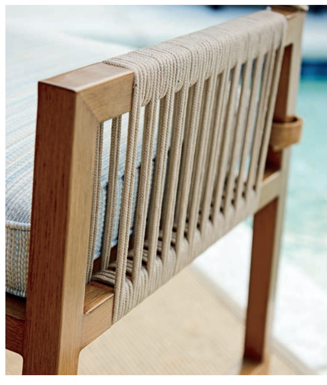
Dining tables in the collection feature an umbrella pass-thru in the top. Included with the table is a decorative monogrammed insert that covers the opening when the umbrella is not in use.