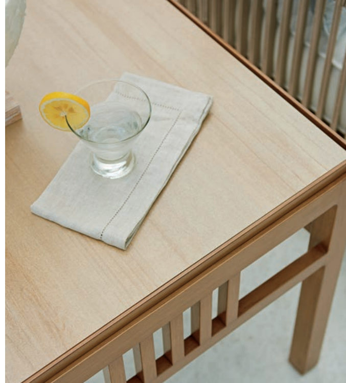
Cultured stone tops on the St. Tropez cocktail and end tables feature an ivory and taupe coloration with vein lines that mirror the look of natural travertine, without the maintenance issues.