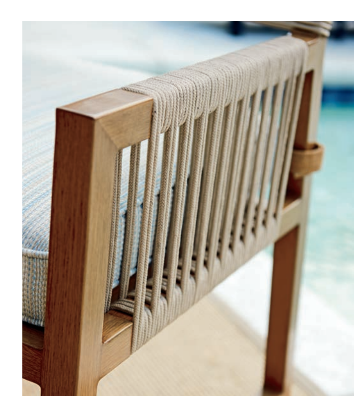
The all-weather premium lanyard cording used in the collection is a high tensile strength PVC and Polyester yarn that is weather proof, highly resistant to UV rays and will not stretch.