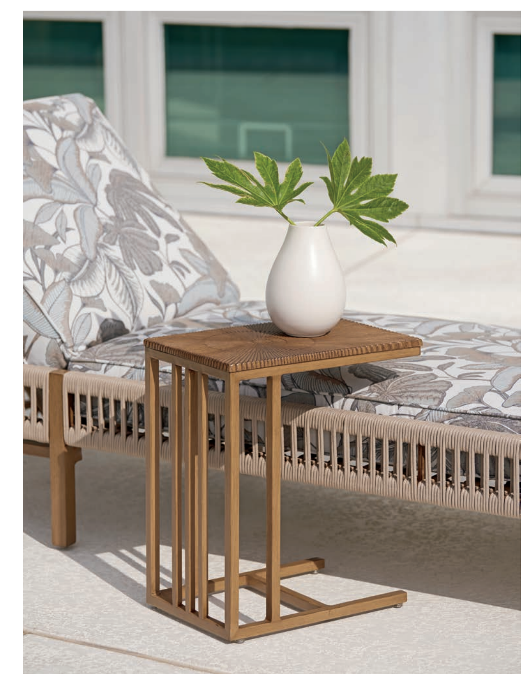
3925-951 St. Tropez Rectangular Spot Table 12W x 18D x 21.25H in.

The rectangular spot table offers an ideal solution for "cocktail management" on the pool deck. The cantilevered end allows the piece to slide comfortably under any seating item. On the opposite page, the St. Tropez chaise lounge highlights the architectural lines of the design with vertical lanyard cording down the length of the frame.